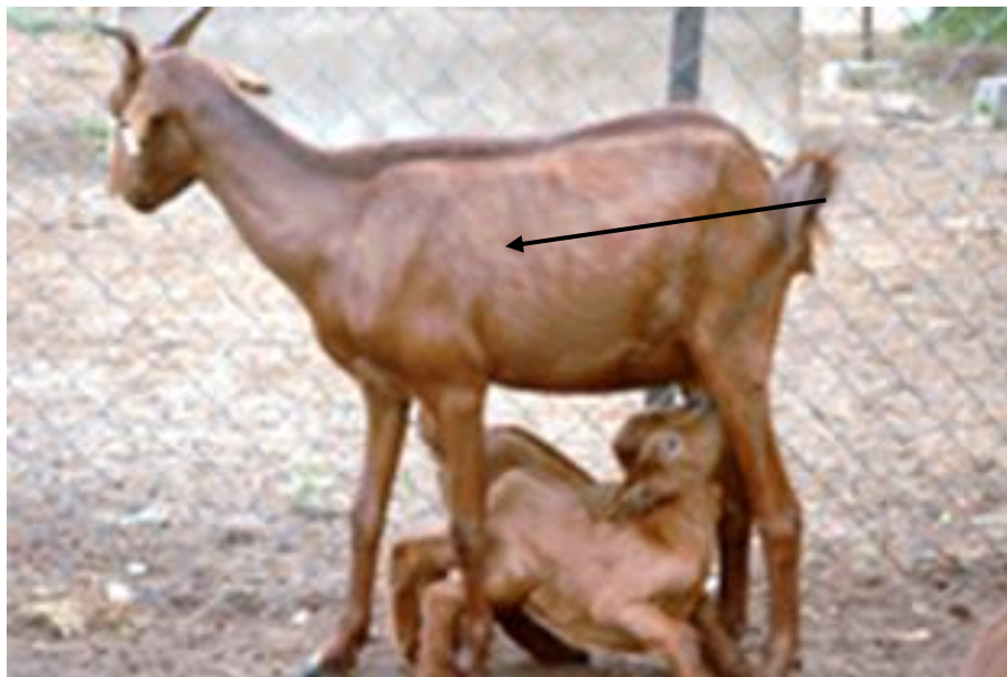
Figure 1: Red kids

At the age of 365 days, both sexes combined, the mortalities recorded in the present study were numerically higher in-group T (10 animals or 50%) than in-group C (3 animals or 15%; p < 0.05 ). Figure 1 and 2 shows the positive effect of colostrum supplementation during the first 15 days of life on the evolution of the survival rate of the animals until the age of 1 year