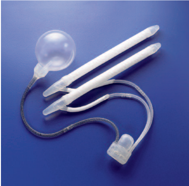
Fig. 1 Three piece CX AMS 700 penile prosthesis