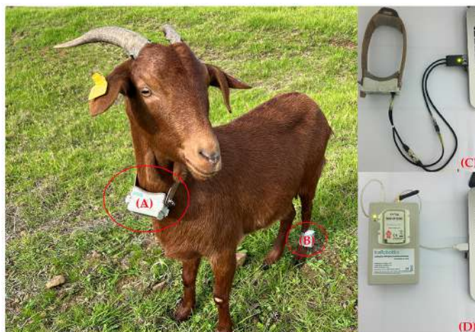
Figure 1. Goat wearing a GPS collar (A) and a leg sensor (B). Downloading GPS (C) and leg sensor (D) data.

walking distances. Activity sensors classified behavior into grazing, walking, or resting. Grazing areas were estimated using kernel density methods to delineate seasonal home ranges. Energy expenditure was calculated from walking distance and activity data. Metabolizable energy intake was estimated from forage availability and diet composition to determine seasonal energy balance. The methods are described in detail by Chebli et al. (2022).