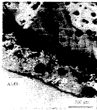
Fig.3. Optical micrograph of a Dy-123 pallet grown on alumina substrate.

The same experiment conducted on a \text{BaZrO}_3 substrate leads to a clear interface between compact and substrate. Yet the pellet of Dy-123 is attached to the substrate. This is due to the high porosity of the substrate used in this experiment inducing diffusion of the liquid phase formed during the peritectic reaction into the porous substrate. But no barium oxide nor zirconium oxide has been observed into the 123 material.