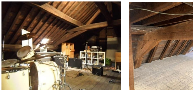
Figure 2. (a) Framework of the Donceel hotel. (b) Framework of Place Emile Dupont 9-10.

The second case study is a group of two buildings in Liège, on Place Émile Dupont, the remains of a cloistered building belonging to the Benedictine abbey of Saint-Jacques. Although the façades were rebuilt in the 19 th and 20 th centuries, these buildings still retain an ancient structure dating back to the 14 th century, which has been modified over the centuries ( Figure 2 ). These case studies reflect the building typologies and construction methods of the Ancien Régime and are particularly well preserved.