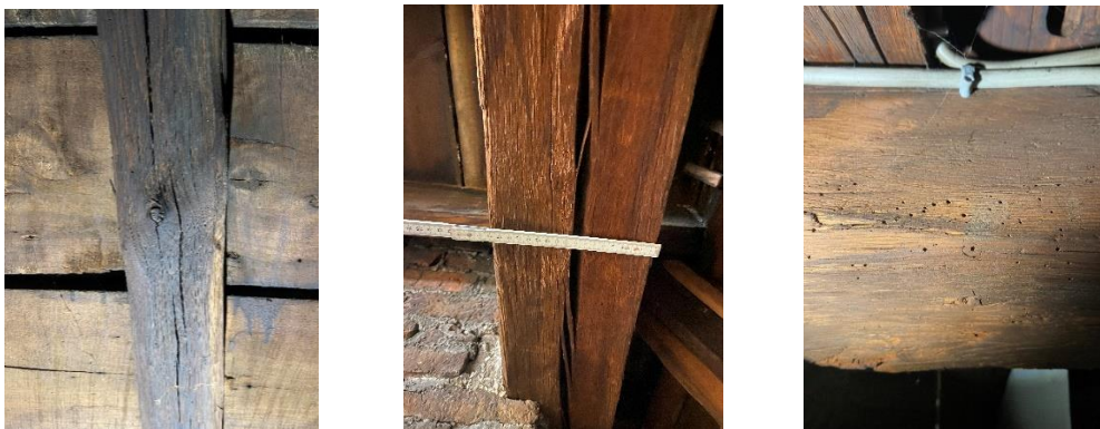
Figure 3. (a) Knots on a rafter from Place Emile Dupont. (b) Drying crack on a tie beam from Place Emile Dupont. (c) Wood-eating insect holes from Donceel hotel.

During the practical phase of the study, several factors were identified, although the process was sometimes hampered by the limited visibility and accessibility of certain elements within the case studies. Firstly, the data collected through the technical inventory and the case studies revealed significant similarities in the dimensions of the structural elements, while also highlighting some variations. These discrepancies could suggest local adaptations or evolutions in construction techniques over time. Secondly, observations from the case studies confirmed the presence of typical characteristics, such as knots ( Figure 3a ), drying cracks ( Figure 3b ), and damage caused by micro-organisms, particularly wood-eating insects ( Figure 3c ). These factors can directly impact the mechanical properties of the wood and influence its classification ( Table 4 ). It is worth noting that oak, when well-preserved, is generally resistant to insect attacks; although minor superficial galleries may occasionally be found in the sapwood, the softest part of the wood, these do not compromise the overall structural integrity. Lastly, some uncertainties remain regarding certain factors, especially the precise identification of wood species. In these cases, assumptions have been made based on the typological characteristics and estimated dating of the timber, although definitive confirmation was not always possible.