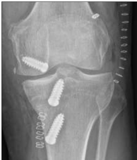
Fig 4: Postoperative radiographs showing well-placed graft tunnels, restored joint alignment, and reduction of medial joint space widening.