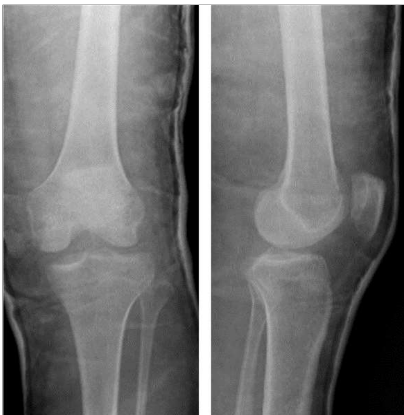
Fig 1: Radiograph showing a widened medial joint space and lateral tibial translation.

Despite initial MCL repair, the knee remained highly unstable, with a persistently positive posterior drawer test. This warranted subsequent ACL and PCL reconstruction, despite the PCL appearing only partially ruptured on MRI. This suggests that in similar cases, central pivot ligament injuries should be addressed early, either before or in conjunction with MCL repair [10].