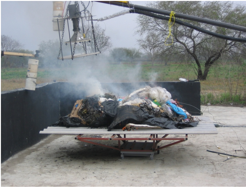
Figure 2 Supp. The experimental setup.