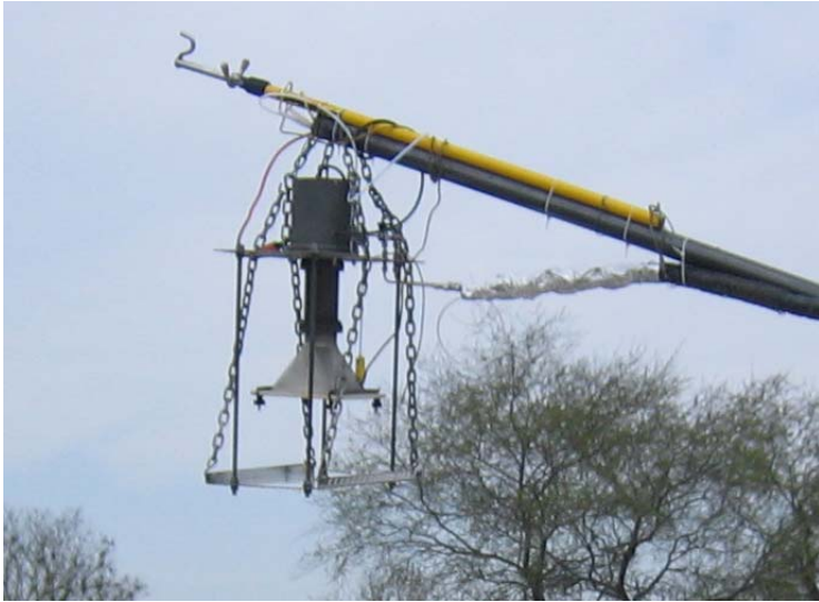
Figure 1 Supp. The air sampling device.