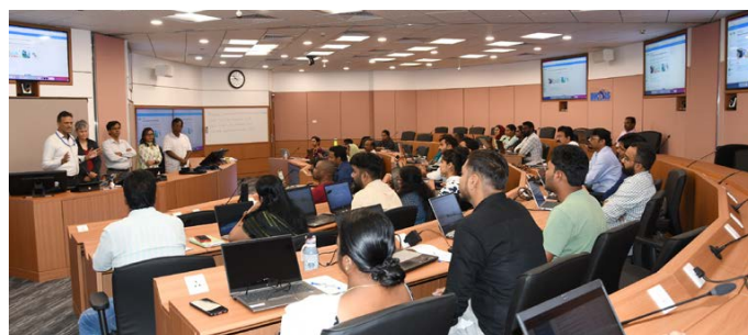
FIGURE 3. Participants, instructors, and organizers at the ITCOcean Hack2Week in Hyderabad, India.

This two-week event provided training in cloud computing and data access with a focus on big Earth science remote-sensing data. It was held in September 2023 at the International Training Centre for Operational Oceanography (ITCOcean) in Hyderabad, India, and brought together 58 early career ocean scientists from Indian Ocean rim countries. The first week focused on training participants in core infrastructure and use of tools including JupyterLab and RStudio, the core scientific geospatial tools available in Python and R for remote-sensing datasets, and working with Git and GitHub. The second week was a hackweek based on participant-developed projects focused on the impacts of marine climate change in the Arabian Sea and the Bay of Bengal. ITCOcean Hack2Week relied on a cloud-based JupyterHub deployment (distinct from JupyterLab and described in Lessons Learned below) as its common computational environment. None of the participants in our course had exposure to cloud computing. About half had worked with ocean remote-sensing data and accessed data held in repositories such as Copernicus, but none had done this in a cloud computing platform. The event was supported by the global OHW 2023 event. During that event, a project team developed tutorials on marine species distribution modeling to be taught at ITCOcean Hack2week, and OHW 2023 participants