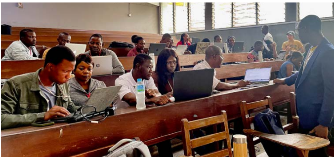
FIGURE 1. Participants, instructors, and organizers at the Python component of COESSING 2023 in Accra, Ghana.

A unique aspect of the COESSING Python component, compared to the other case studies presented here, is that it did not begin as a hackweek format. Rather, it evolved into a program that has ended up resembling a hackweek based on participant and instructor feedback. After three years with proprietary