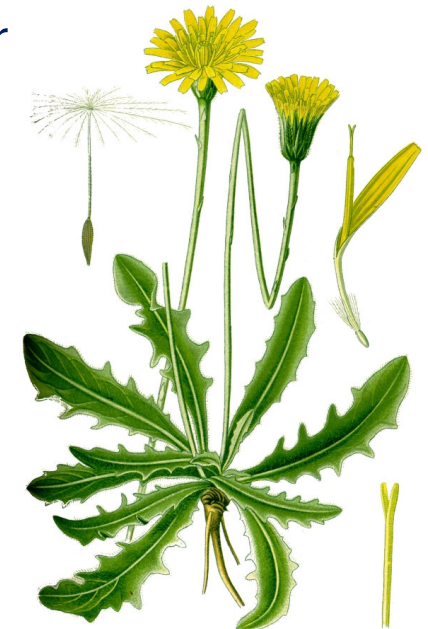
Hypochoeris radicata L.