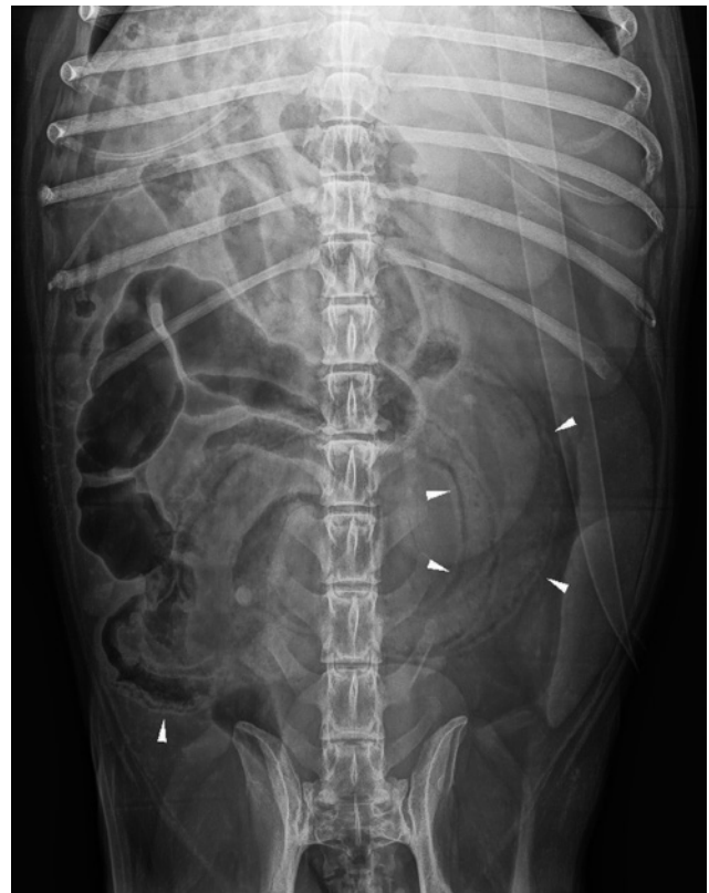
Figure 2. Ventrodorsal radiograph of the abdomen showing linear and irregular accumulations of gas within the small intestinal wall.

the conformation of the jejunal loop, while in other segments, it appeared straighter. A heterogeneous soft tissue material was visible within the lumen, with few gas bubbles dispersed within this material (Figures 2, 3 and 4).