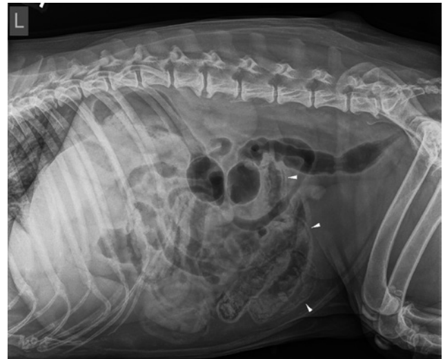
Figure 4. Left lateral radiograph of the abdomen showing gas lucencies within the small intestinal wall.

ly described abnormal segment. A large portion of the gastrointestinal system was either empty or gas filled showing no evidence of an intestinal obstruction.