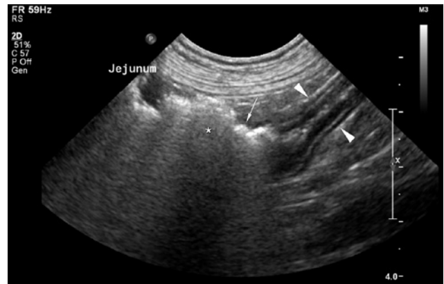
Figure 1. Abdominal ultrasound showing abnormal presence of presumed intramural gas in a segment of the jejunal wall and loss of wall layering (white arrow), in continuation with a normal jejunal segment (white arrowheads). The intramural gas creates an irregular distal acoustic shadow artefact (asterisk).

On the abdominal radiographs, a linear intramural gas opacity was seen in a part of the jejunal loops, parallel with the serosal surface, suspected to be at the level of the more central layers (mucosa and submucosa). At several locations, this linear gas opacity had a mildly undulating appearance, possibly consistent with minimal peristalsis or simply following