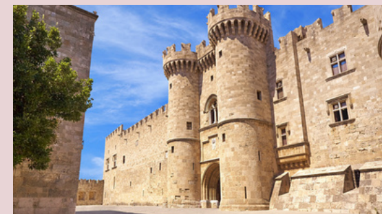
Rhodes - Medieval Centre

The conference activities will take place at the Department of Mediterranean Studies, University of the Aegean, Rhodes Island, Greece. The conference will organize for all participants a guided "Walking Mobile Work-shop" in the Medieval core of the city of Rhodes, which is a preserved masterpiece, protected by UNESCO as World Heritage. The conference will also organize for all participants a one-day-cruise to Symi Island by chartered boat on Wednesday 26 June 2024.