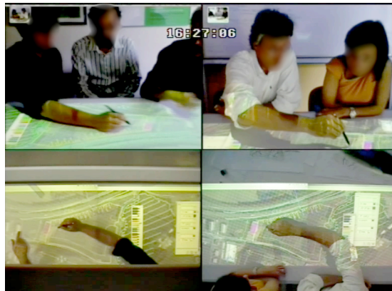
Fig. 4 : Screenshot of collaborative session recording (front view and top view).

Furthermore, industrial partners (mechanical engineering office and an architectural office) have shown to be very interested by this environment for their professional practice and foresee many real advantages by adopting our technological solution.