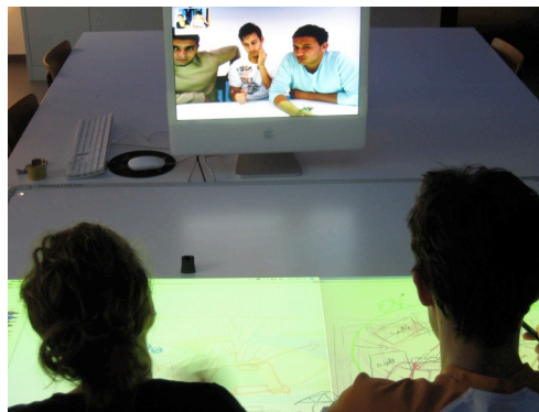
Fig. 3 : Distributed Collaboration Design Studio.

Pointing, annotating and drawing are possible thanks to the electronic pen that activates the virtual desktop drawing recognition. Social exchanges are transmitted through external modules (videoconference commercial solutions) in order to support the vocal, the visual and the gestural aspects of the collaboration. The system is thus completed by a 24 inches display with an integrated camera, that allow the participants to see and talk to each others, in an almost 1/1 scale, during a real-time conference. This integrated camera is in fact a very simple way to avoid the gaze deviation when talking to interlocutor(s) (see fig 3 for the whole environment).