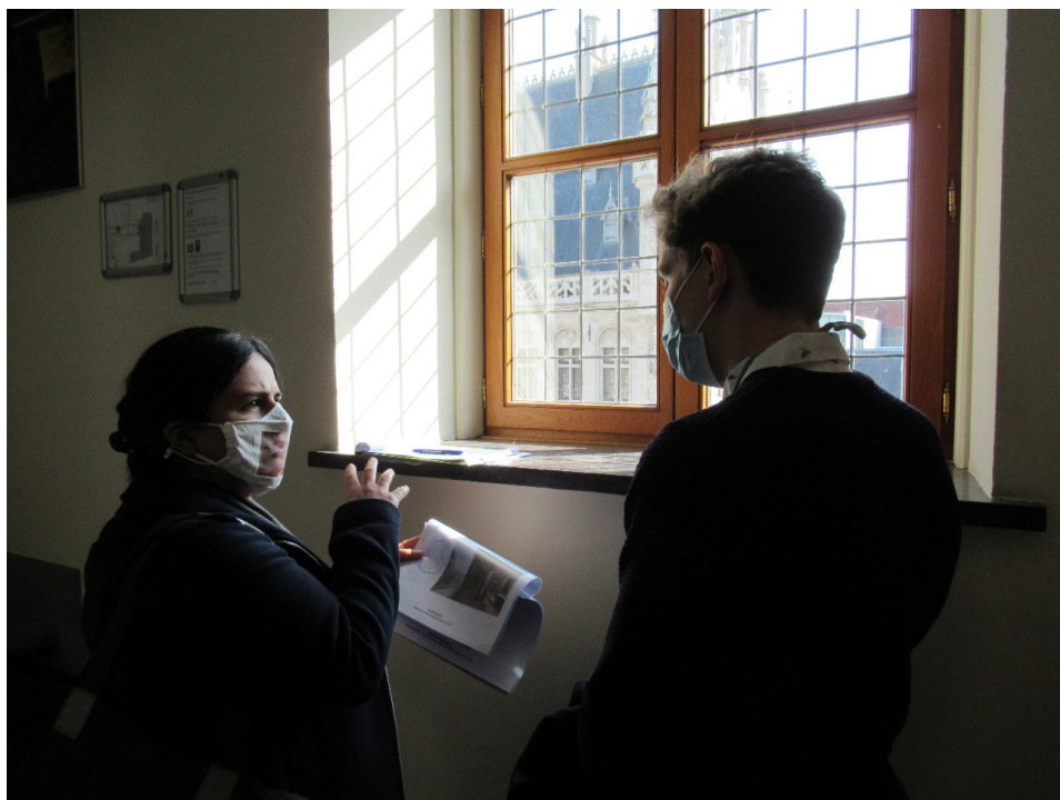
Fig. 2 In situ go-along interview with user/expert (Kobe) at the Stadhuis Leuven

The participants in each visit included one user/expert, a researcher (the first author), and a person assisting in data collection (mainly by taking photographs). The data collected included photographs, audio recordings (voice recorder), video recordings (GoPro mounted on the user/expert) and observatory notes. Audio recordings were transcribed and pseudonymized.