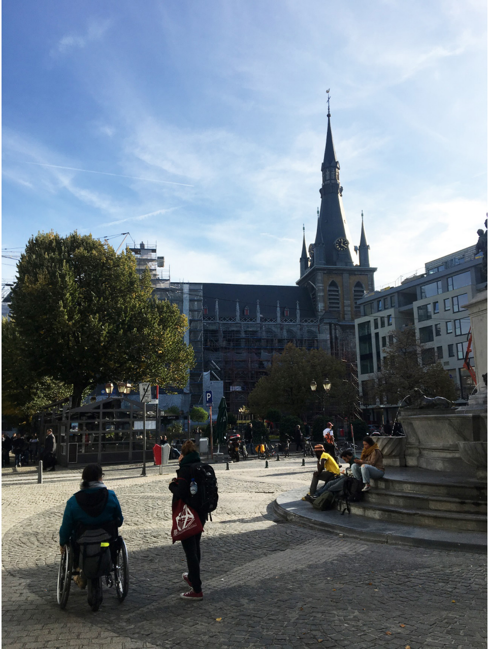
Fig. 3 Visit of the historic centre of Liège with Clara