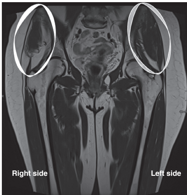
Figure 2 Coronal pelvic MRI demonstrates evidence of significant fatty atrophy of the right gluteus muscles compared to the left side.