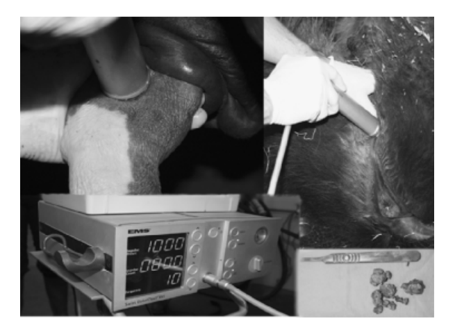
Fig 1. Radial extracorporeal shockwave therapy (ESWT) (EMS Dolorcast, lower left) application directly on the penis on the image in the upper left corner. The image on the upper right shows case # 2 on its back with radial ESWT applied in the perineal region.

A 3rd case, a 6-year-old Belgian Draft Horse gelding was referred to the hospital for further examination after showing moderate signs of colic. The horse had difficulty working and the owner had not seen it urinate during the day. On admission, the horse had tachycardia and tachypnea. Borborygmi were diminished in all quadrants on abdominal auscultation. Blood analysis showed a slightly high PCV. Rectal examination revealed a large distended bladder and catheterization of the urethra was not possible. A firm mass of approximately 6 cm was palpated in the distal portion of the penis. A perineal urethrotomy under local anesthesia was performed in the standing horse to relieve intravesical pressure before fragmentation of the calculus with a radial ESWT device. The penis was firmly grasped at the site of the calculus and the ESWT device was directly applied on the penile shaft without use of any contact gel (Fig 1). While applying the shock waves (pressure setting at 2.5 bar, 7 Hz), sand-like content progressively dropped from the penis a few seconds after application and the calculus fragmented. Finally, after partial fragmentation, which took about 5 minutes and approximately 2,500 pulses, the calculus was fully retrieved after it naturally dropped from the urethral opening. The recovery of the horse was