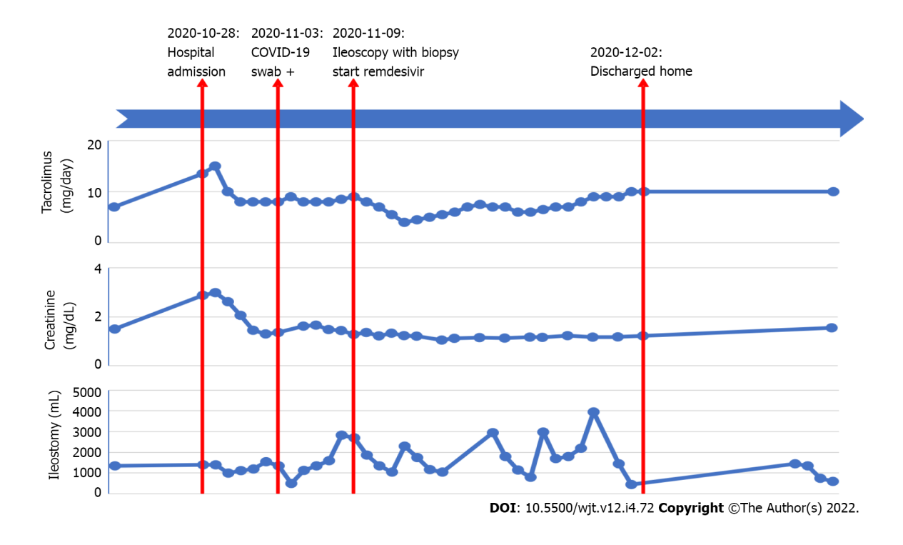
Figure 1 Timeline of case report, with immunosuppressive regimen (total daily tacrolimus dosage; bidaily administration), serum creatinine (kidney function), and stomal output evolution. COVID-19: Coronavirus disease 2019.