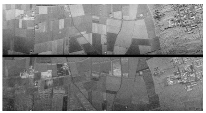
Figure 3: Example of processed SAR data (HH) simultaneously acquired during the SARSense campaign. Top: L-band, bottom: C-band.

The airborne polarimetric (dual linear, V and H) SAR datasets at C- and L-band were acquired and processed by Metasensing. The dual-frequency system was operated on board a Cessna 208 at a nominal altitude of 5500 ft, resulting in a left side looking configuration with an antenna look angle of 45°. While at C-band the planned 200 MHz signal bandwidth could be transmitted, at L- band only 50 MHz were allowed by the local authorities, resulting in a coarser image resolution. An example of processed SAR data is given in Figure 3.