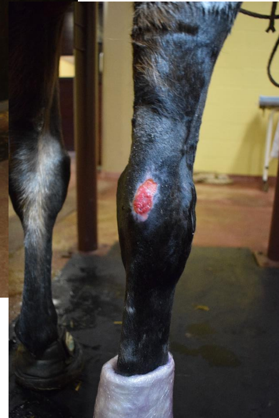
After graft preparation