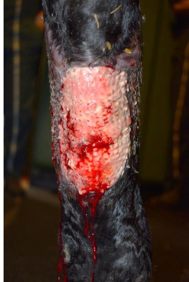
VWHA Milan 2023