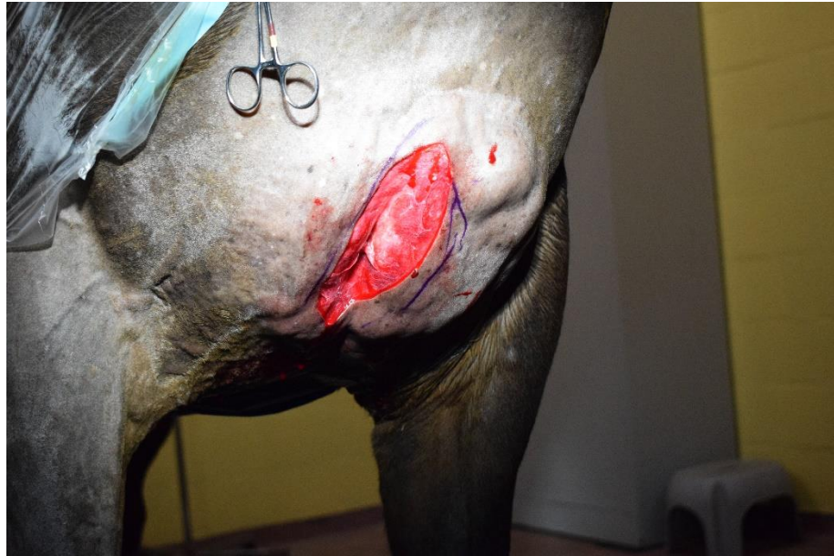
Primary intention healing of donor site