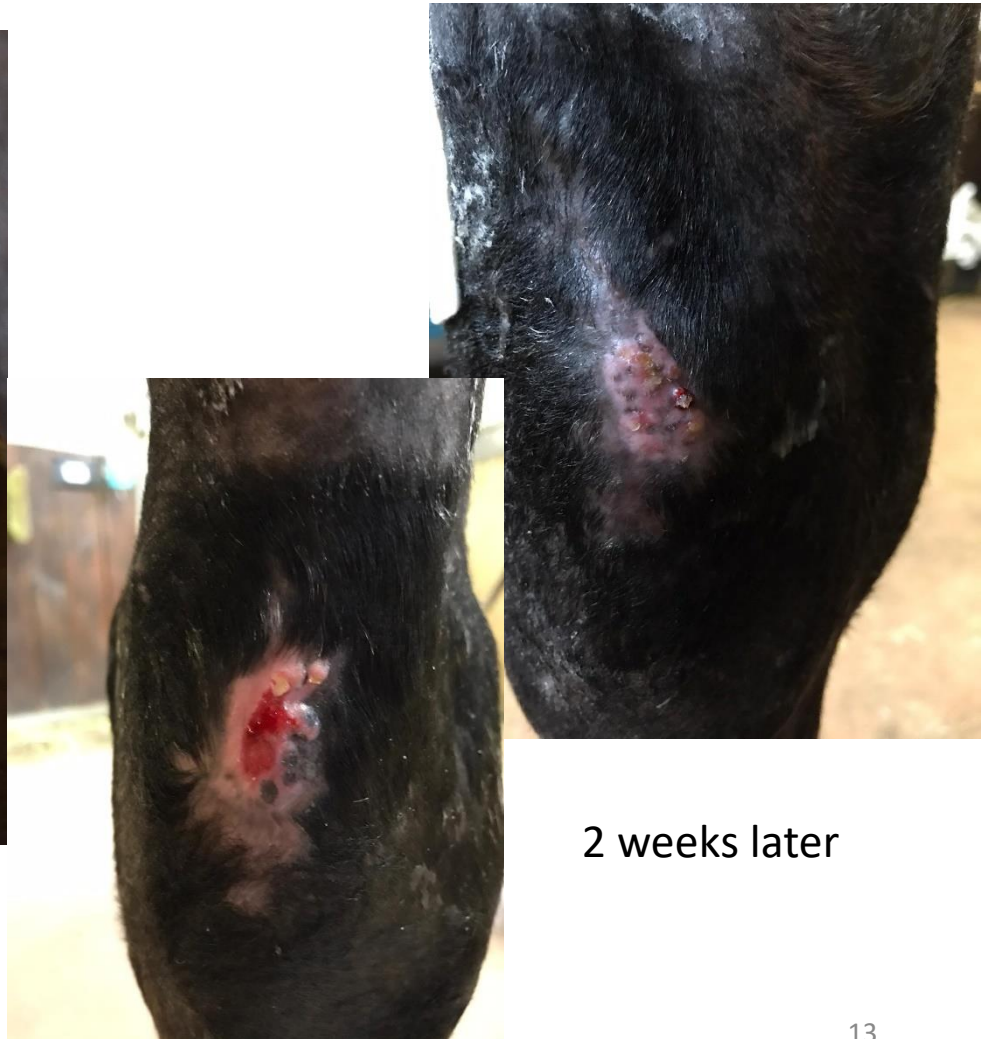
2 weeks later