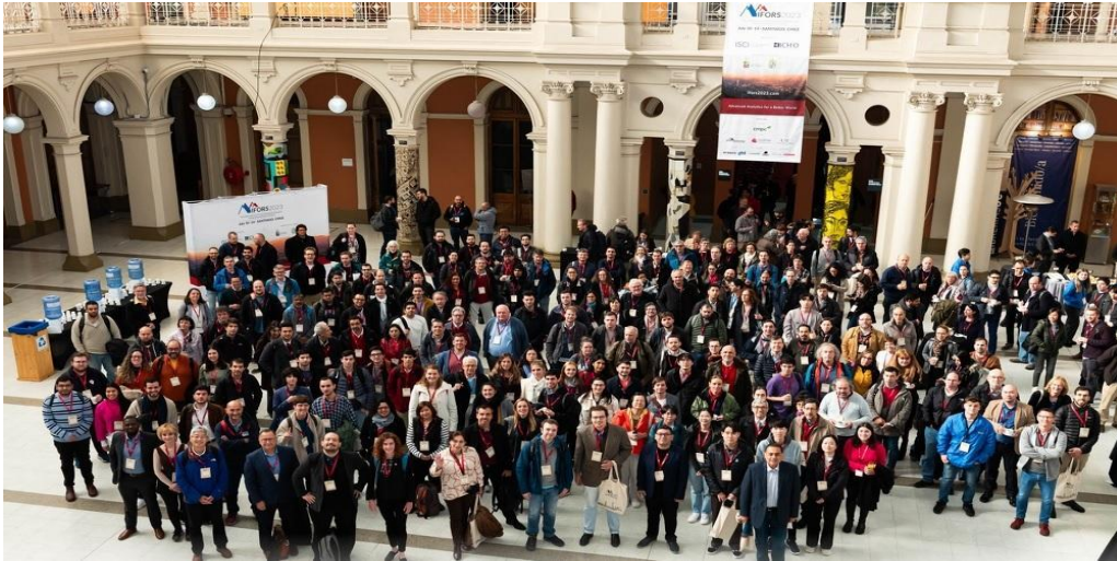
IFORS 2023 attendants say hello to the rest of the world!

(An extended version of this text has been published also in the September 2023 IFORS Newsletter)