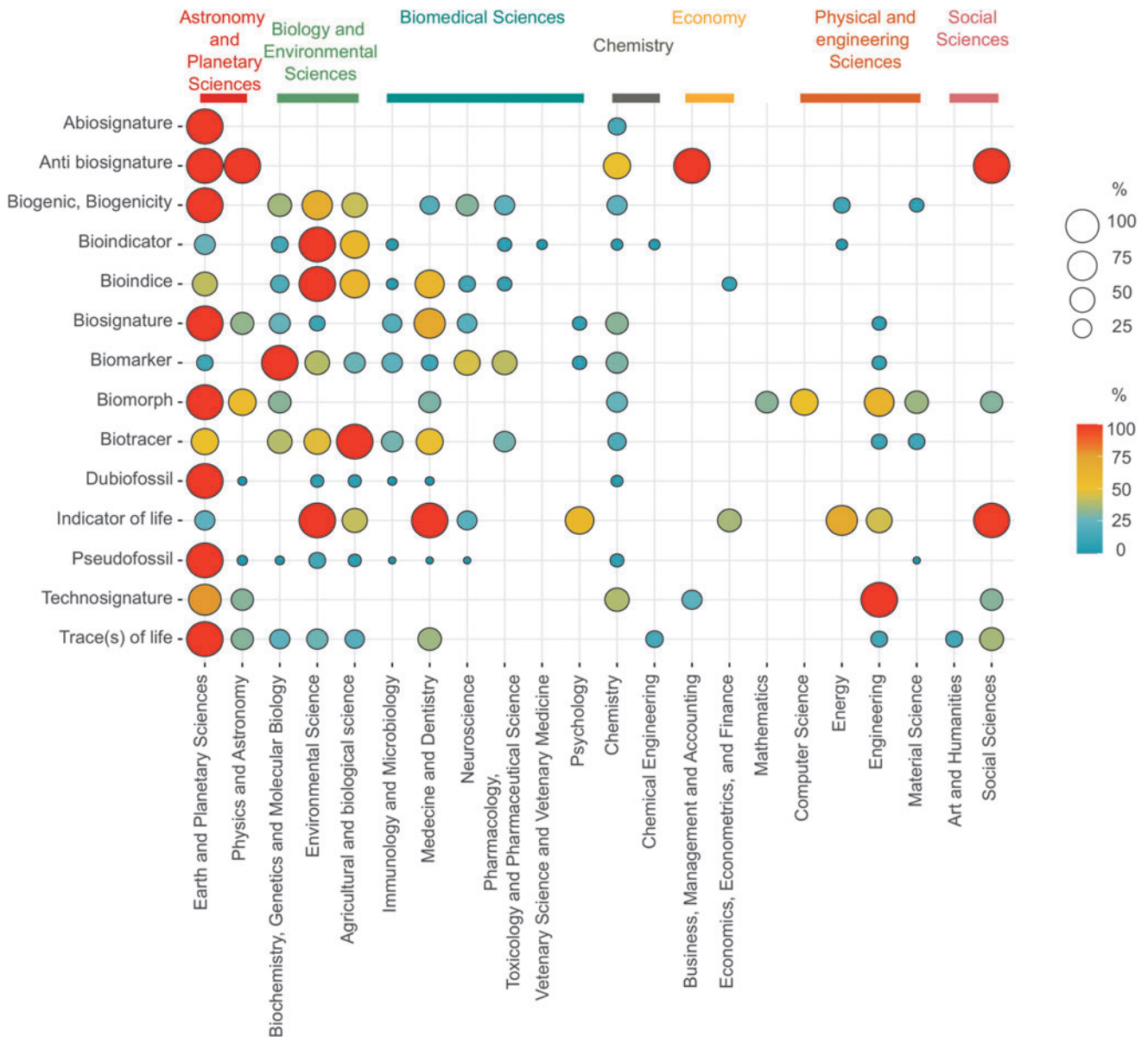
FIG. 2. Usage of “biosignature” and related terms depending on disciplinary context. Standardized number x of articles in each discipline as recorded by Science Direct , where x =number of articles for the keyword per discipline/maximum number of articles for the keyword across all disciplines.

plurality of ways of understanding biosignature-related terms, all conducive of possible misunderstandings.