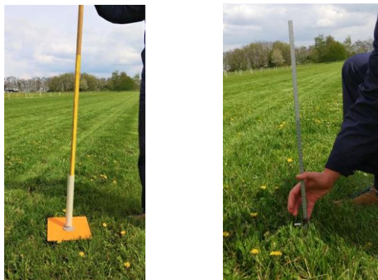
Monitoring of grass growth and biomass accumulation through manual measurements