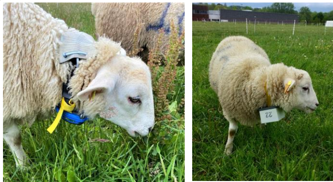
Monitoring the position and behavior of animals on the pasture with GPS collars

To support farmers through technology in the management of their pastures in the face of climatic variations.