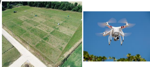
Monitoring vegetation development and condition through drone flights