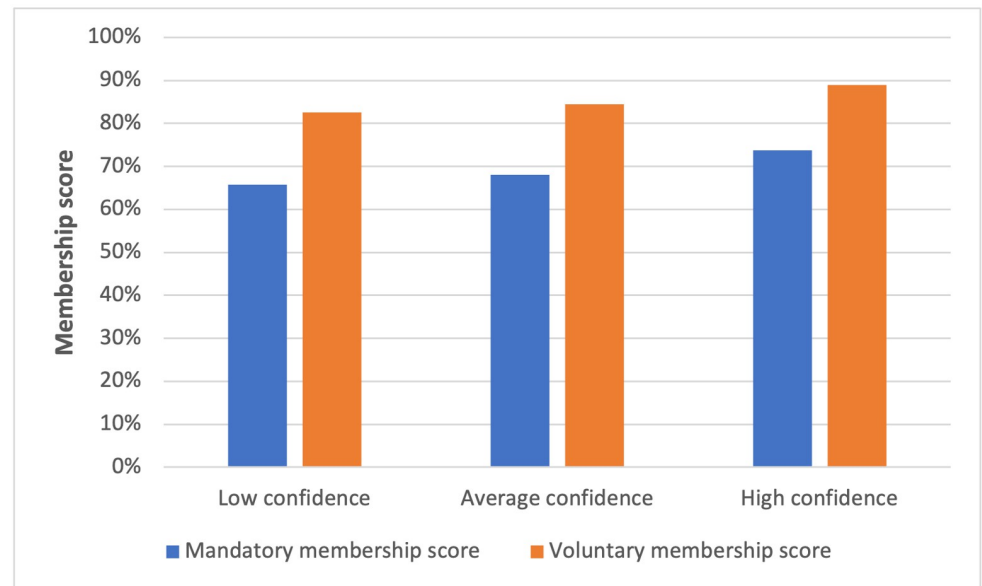
Fig 2. Level of membership score according to confidence (low, medium, high) in the current health system. Note: Fig 2 shows that the more confidence respondents have in the health system, the more likely they are to join the insurance.

https://doi.org/10.1371/journal.pgph.0001859.g002