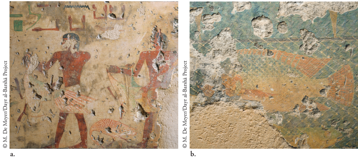
FIG. 2. Details from the decoration in the tomb of Djehutihotep: Two offering bearers carrying fowl on the lowermost register of the east wall of the shrine (a, left) and a Tilapia caught in a net, from the fishing scene on the north wall of the inner chamber (b, right).

colours as a gradient (fig. 2b). Such technical resourcefulness was applied in juxtaposition with traditional and often even archaic features to create a unique synthesis of styles, both in iconography 10 and in text. 11 This creates a remarkable and attractive result, often placed among the most impressive examples of Middle Kingdom art. 12