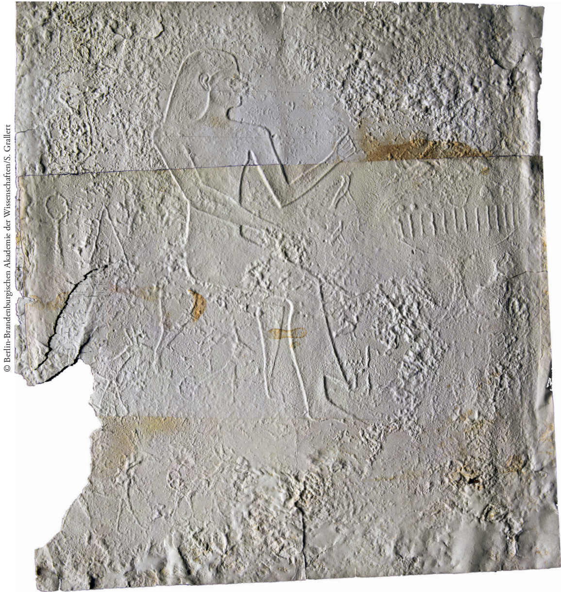
FIG. 7. Squeezes from Hatnub Graffito XIII, BBAW A.3670/1-2.

To properly frame Horemnyankhu's self-thematization in the tomb of Djehutihotep, we should compare his record with the wider corpus of ancient Egyptian artist representations. It is only by considering the context that it becomes clear whether and how his attestations stand out within the contemporary, preceding and succeeding tradition.