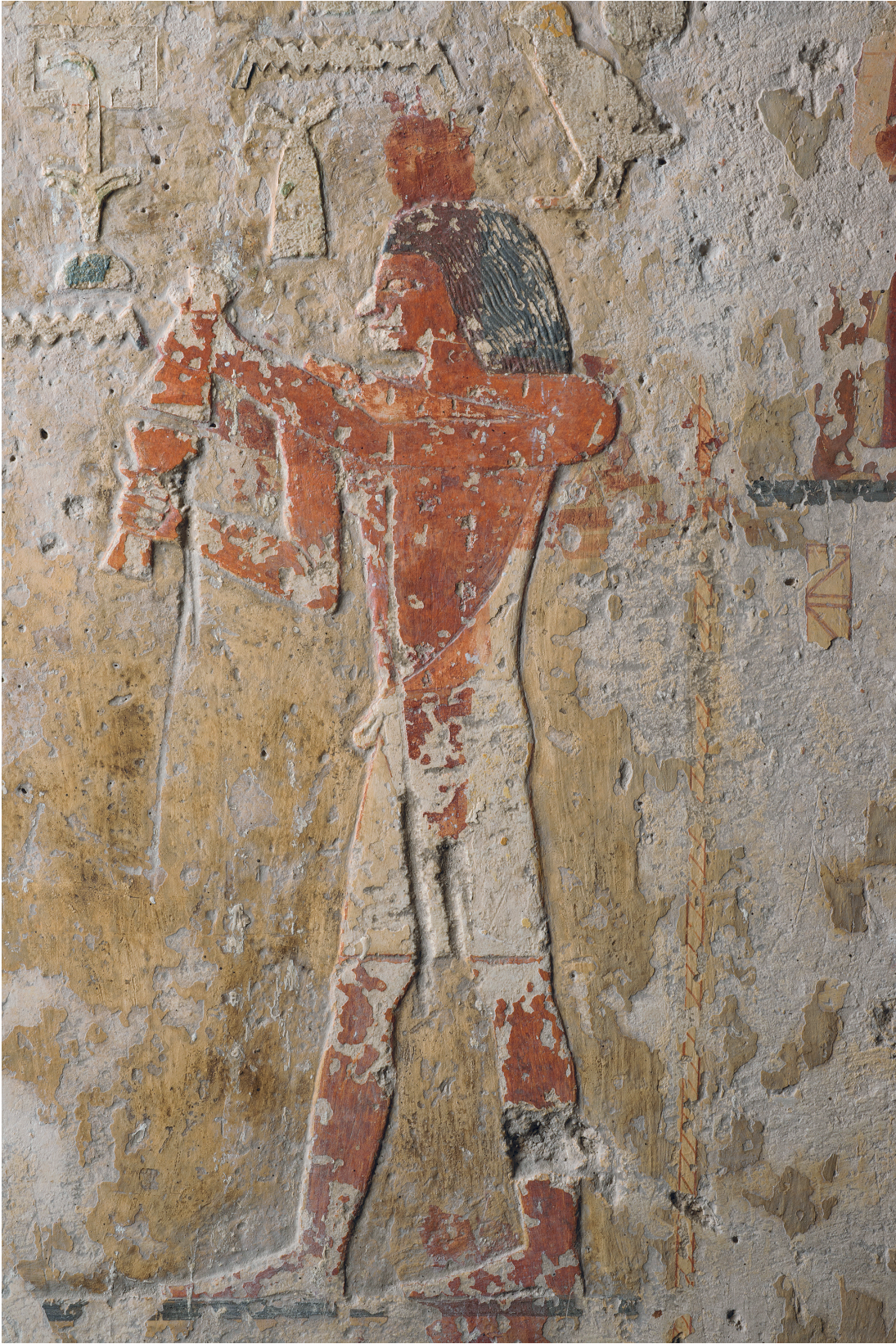
FIG. 5. Representation of Hor-ameny-ankhu, from the west wall of the inner chamber.