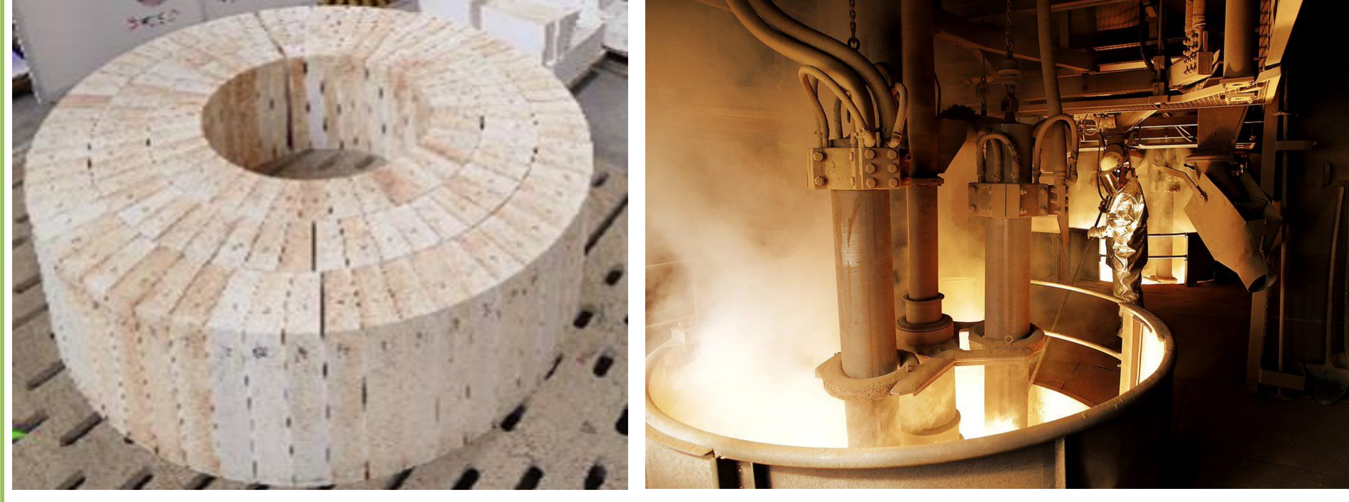
Figure 1. Mullite-alumina bricks