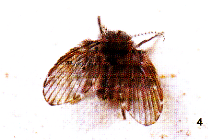
Figs. 1–4. Clogmia albipunctata . 1.– Belgium, West Flanders, Beernem, 13 September 2008. Photo Geert Vanhulle. 2.– Male genital appendages of one of the specimens of C. albipunctata collected at the CHU Brugmann hospital in Brussels. Photo Louis Boumans. 3.– In Gent, Clogmia albipunctata was found to breed in garbage containers in September 2008. The pupa belongs to a different family of Diptera, possibly Phoridae. Photo Michel Vuijlsteke. 4.– This picture of Clogmia albipunctata taken in Gent in August 2004 currently represents the oldest known Belgian record. Photo Michel Vuijlsteke.

In addition to these collected specimens, browsing the internet yielded several pictures of this pretty moth fly taken in Belgium. These are listed in Table 1. So far, the earliest documentation of C. albipunctata from Belgium dates from August 2004.