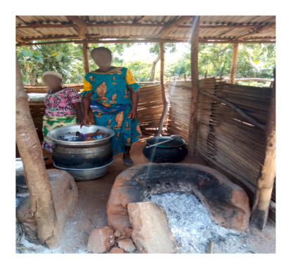
A : Overview of a canteen kitchen