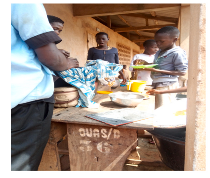
B : Food vendor surrounded by school children