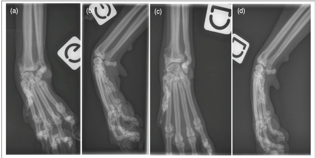
Figure 2 Orthogonal radiographs of both forelimbs demonstrating the presence of a carpal flexural limb deformity with a certain degree of valgus deviation of the distal extremities starting from the carpal joint and hyperflexion of the digits. (a) Dorsopalmar radiograph of the left forelimb; (b) lateral radiograph of the left forelimb; (c) dorsopalmar radiograph of the right forelimb; and (d) lateral radiograph of the right forelimb