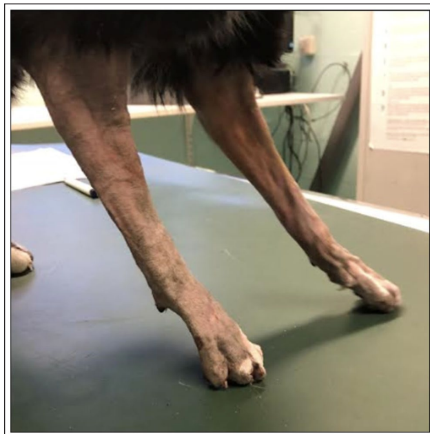
Figure 5 Photograph of a lateral oblique view of both forelimbs of the cat 24 h postoperatively, demonstrating near-complete resolution of the carpal flexural deformity

Follow-up after the second intervention occurred by phone contact. One month after the second intervention, the cat was free of lameness and had no CFD of the forelimbs. The Last follow-up was performed 6 months