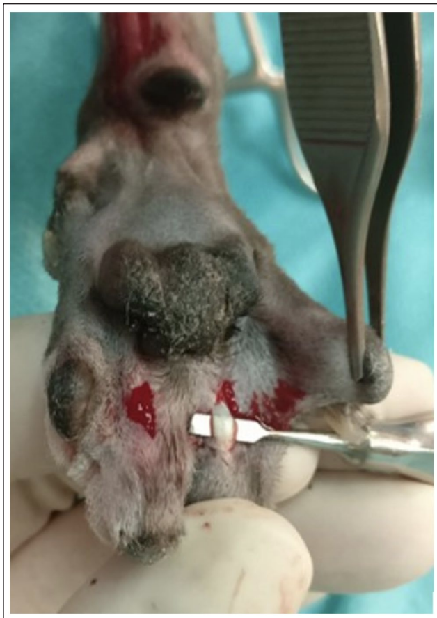
Figure 4 Intraoperative visualisation of the small skin incisions made at the palmar surface of the second phalanx of the third and fourth digit of the right forelimb, allowing for selective tenectomy of the tendon branches of the deep digital flexor muscle (elevated by a periosteal elevator)

two, three and four, and valgus deviation. The region of the flexor retinaculum was again indurated due to tendons in tension. No abnormalities were observed on the right forelimb. A selective tenectomy was repeated on the left forelimb. The same anaesthetic protocol and surgical approach, as mentioned above, were used. Fibrous tissue connecting both ends of the tendon was present at the previous tenectomy sites. More tenectomies were performed over a length of 10 mm of the tendons of the FCUM, FCRM and SDFM proximally to the antebrachio-carpal joint. Also, the tendon branches of the DDFM of the second, third and fourth digits were sectioned. Twenty-four hours postoperatively, the lameness had improved slightly. The cat was discharged with meloxicam (0.05 mg/kg q24h for 7 days [Metacam; Boehringer Ingelheim]).