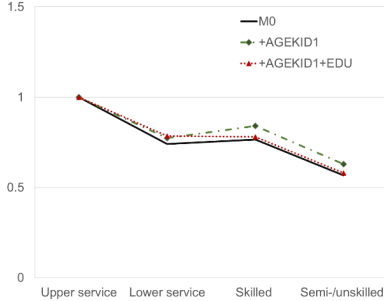
Panel 1: Male sample