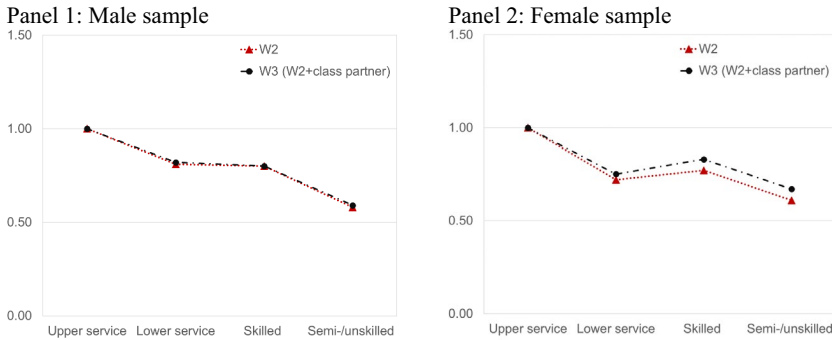
Fig. 1 Piecewise constant event history model. Relative second birth risks (hazard ratios). Note: The analysis was conducted on the sample with respondents with valid information on partner’s class position (n = 81,669 person-months for male sample; n = 83,654 person-months for female sample). Further variables in the model are age of first child, age at first birth, education, region, migration status, own social class, social mobility, and financial worries. Hazard ratio for “not employed” is not displayed in the figures due to the small sample size in the male sample. * p < 0.1 ; ** p < 0.05 ; *** p < 0.01 .