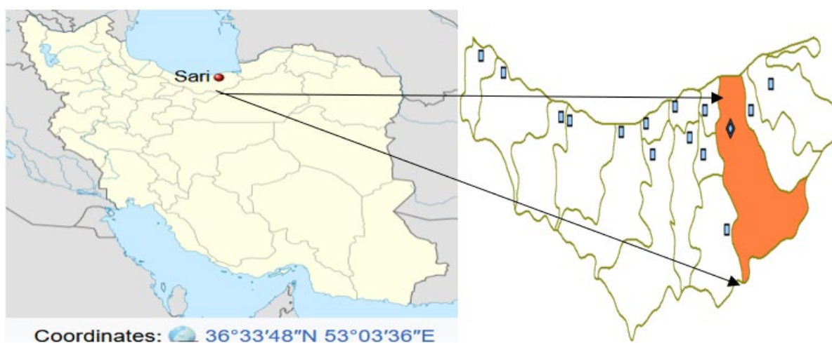
Figure 1. Geographical location of Sari County in Mazandaran Province (Northern Iran).

The research was performed in Northern Iran, in Sari County of Mazandaran Province (Figure 1). With an area of 538 km 2 , Sari County is positioned in Mazandaran Province, bordering the Caspian Sea to the north. The county has a simple hilly area to the south. Due to favorable temperatures (average temperature is 15 °C) and sufficient rainfall (average rainfall is 789.2 mm), the hills of this region are filled with woods up to an altitude of around 1500 m where the sea water can touch. However, the higher altitudes sustain natural pastures [52]. Agriculture is the most important economic activity of the people living in the villages of the area, and more than half of its agricultural lands are covered with rice fields. Out of 22,508 hectares of paddy farms in Sari, 9800 hectares are irrigated with a new advanced method, and 12,708 hectares are irrigated with a conventional system, of which more than half are fed by Tajan and its branches such as Zaramrud, Tajan, and Sefidrud [53] (see Figure 2).