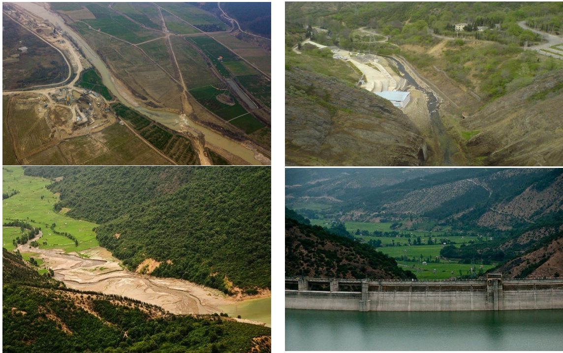
Figure 2. Tajan River and its tributaries. (Irrigation source of rice farms in Sari city).