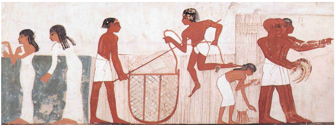
Fig. 3 Tomb of Nakht (TT 52); Thutmose IV – Amenhotep III. Scene of pulling flax (after Shedid – Seidel 1996: 35)

Laboury’s demonstration of the intericonic relationships between the different versions of the scene of pulling flax in the context of the Theban necropolis is based on the identification of distinctive transformations (including inversion) of formal elements, adding to contextual data (Laboury 2017: 236–239, fig. 4). It begins with the now famous version of the tomb of Nakht (TT 52), dated to the time of Thutmose IV on stylistic grounds (fig. 3) (Porter – Moss 1960 I/1: 99 (2) II). 16 According to the author, who follows Christine Beinlich-Seeber and Abdel Ghaffar