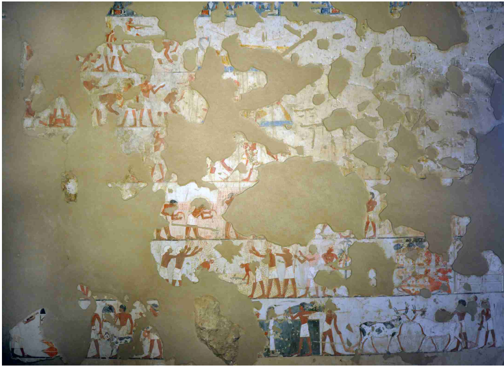
Fig. 5 TT 143 (tomb owner's name unknown); Thutmose III - Amenhotep II. Agricultural scene