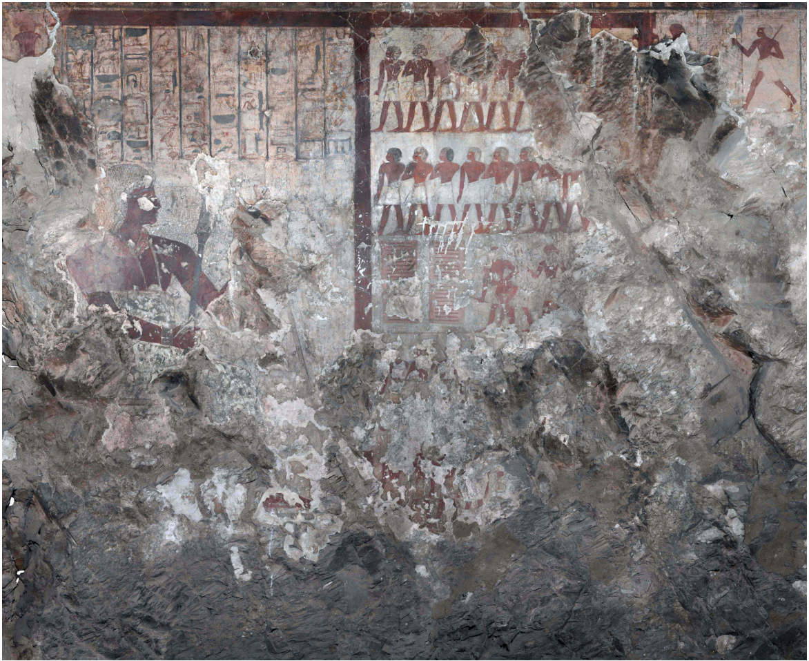
Fig. 12 TT 29 (Amenemopet); Amenhotep II. Vizier's office

units from the neighbouring TT 100, granting particular attention to the scenes distinctively illustrating his position as vizier.