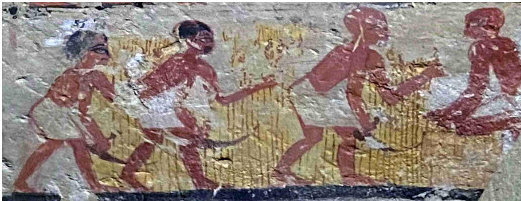
Fig. 6 T Bubasteion II.x (Ptahmes); Amenhotep III. Scene of pulling flax

sides, it seems that its long-established association with TT 52 and the Theban repertoire in the Egyptological tradition should be revised as it now also appears, together with three figures of gleaners, in the tomb chapel of Ptahmes at Saqqara (T Bubasteion II.x), dated to the reign of Amenhotep III (Zivie 2010) (fig. 6). 25