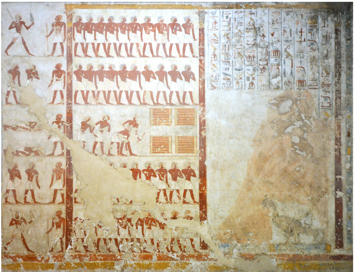
Fig. 11 TT 100 (Rekhmire); Thutmose III – Amenhotep II. Vizier’s office