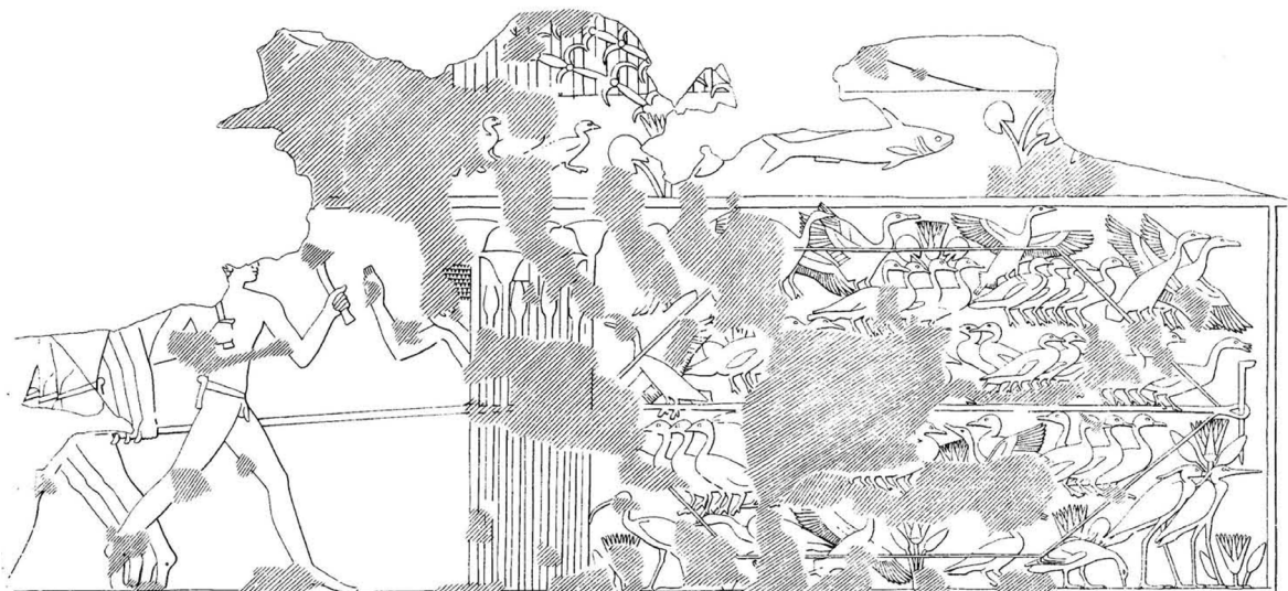
Fig. 1 Tomb of Puyemre (TT 39); Hatshepsut – Thutmose III. Fowling scene: giving the signal for pulling the net (after Davies 1922: pl. XV)

In many rich iconographic environments, such as the Theban and Memphite private necropoleis, it is not surprising to come across iconographic units that present as nearly exact inverted replications of others (figs. 1–2). It could well be argued that these inversions – which assumedly link a copy to a model – are just purely instantiations of iconographic types stemming from the aforesaid repertoire that the painters accessed through memory and experience, as implied in Irtyesen's statement. However, it seems that in several cases the formal connections are sufficiently numerous, the type relatively uncommon, and, above all, the intericonic context, or web, suitably limited to render the presumed connection between a copy and a model highly plausible (Laboury 2017: 236–239), if not intentional or deliberately conspicuous in the eyes of