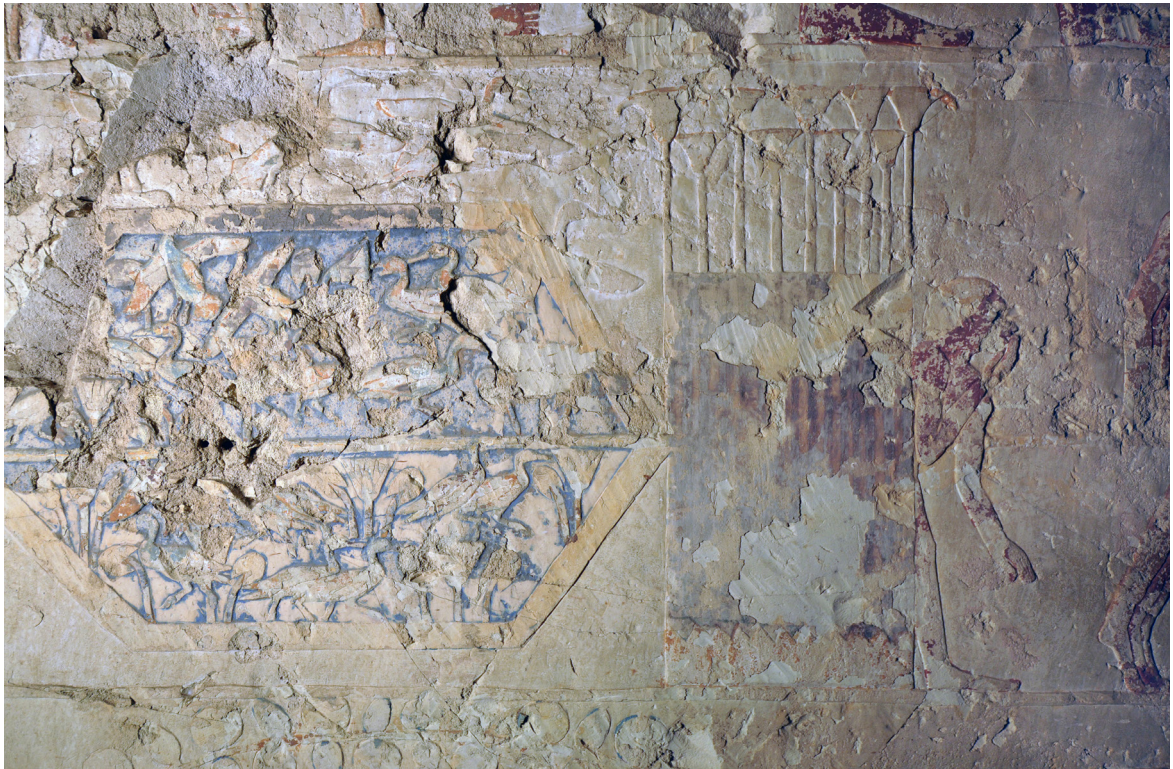
Fig. 2 Tomb of Nebenkemet (TT 256); Amenhotep II. Fowling scene: giving the signal for pulling the net

certain initiated visitors to the funerary chapels. 8 Although it is possible to prove through art historical analysis that such intericonic connection does exist, and might have therefore been intentionally suggested by the artist (involving or not the commissioner), it is in effect only the actual beholder who eventually acknowledges, and thereby determines in terms of meaning, a certain indexical value to the copy – and the Egyptologist is no different in this respect.