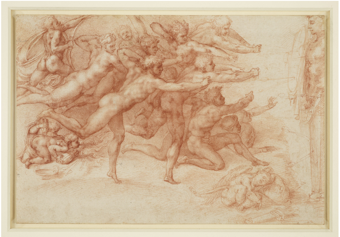
Fig. 7 Michelangelo Buonarroti, Archers Shooting at a Herm , 1530–1533; red chalk on paper, 21.9 × 32.3 cm; New York, Metropolitan Museum of Art (lent from the Windsor Castle Royal Collection)