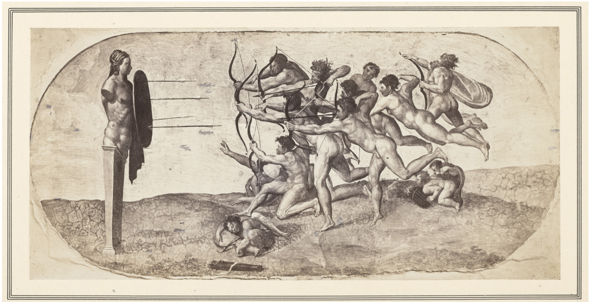
Fig. 8 Girolamo Siciolante da Sermoneta, Archers , 1544–1545; detached fresco, 104 × 208 cm; Rome, Borghese Gallery. Reproduction on sheet of paper (15.9 × 34.3 cm) published by Ruland (1876: 288) (© Royal Collection Trust)