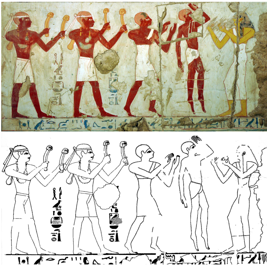
Fig. 10 TT 82 (Amenemhat); Hatshepsut - Thutmose III. Dance scene (drawing Davies - Gardiner 1915: pl. XX)