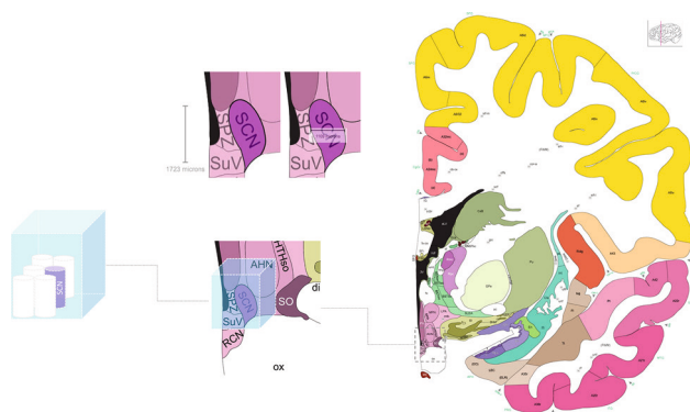
Fig. 1. Representation of the (3 \times 4 \times 3) \text{ mm}^3 volume of interest (VOI) used by Schoonderwoerd et al. to extract and average BOLD signal around the SCN. Left: The SCN is estimated to be (1.7 \times 1.1 \times 1.1) \text{ mm}^3 ( \sim 2.1 \text{ mm}^3 ) cylinder that is \sim 18 times smaller than the 36 \text{ mm}^3 VOI. Middle and Right: The SCN and its surrounding nuclei. Its representation has been zoomed in from the brain atlas displayed on the right (4). The VOI is placed around the SCN.