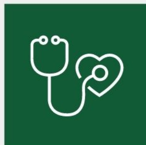
Cardiovascular Diseases & Periodontitis