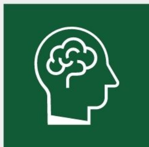
Cognitive Decline & Periodontitis