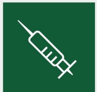
Diabetes & Periodontitis