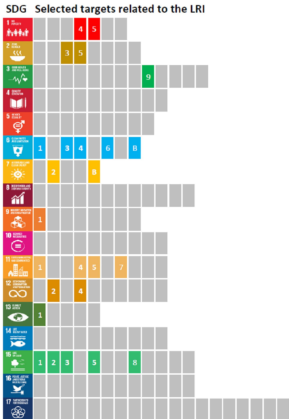
Fig. 2 Illustration of all selected SDG targets that call for action in the LRI specifically related to hydrological, geomorphic, and/or ecological processes

beds to straighter channels with lower geomorphic activity (Grabowski et al. 2014). These changes can be caused by the presence of flow regulating infrastructure and resulting changes in sediment transport and channel incision (Brandt 2000), agricultural embankments (Fuller et al. 2019), or a compounding effect of several factors (Surian and Rinaldi 2003). These human-induced alterations to river form and surface water connectivity with floodplains can make the