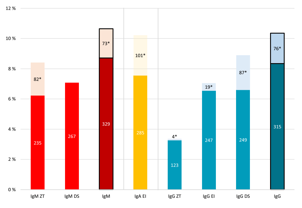
Figure 1. SARS-CoV-2 seroprevalence (%) in phase 1 according to the type of test used. * indicates borderline results. IgM: positive for \geq 1 IgM test; IgG: positive for \geq 1 IgG test. DS DiaSorin, EI EuroImmun, ZT ZenTech.