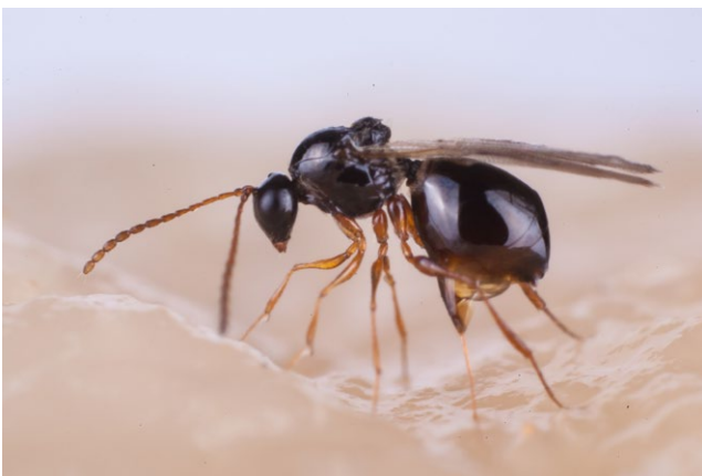
FIGURE 1 Model parasitic wasp Leptopilina heterotoma .

Between-species variation in the ability for lipid synthesis became evident by testing a large number of taxonomically distinct parasitoid species (Visser et al., 2010), but only few species were tested repeatedly for the ability to synthesize lipids (Giron & Casas, 2003; Rivero & West, 2002; Visser et al., 2012, 2017). An exception are species in the genus Leptopilina , which have been popular model systems for a multitude of research fields, including, but not limited to, studies on (theoretical) ecology and behavior (e.g., foraging behavior), chemical communication (e.g., host-finding cues), life histories (e.g., time vs egg limitation), and physiology (e.g., host immunity) (Fleury, Gibert, Ris, & Allemand, 2009; Haccou, Vlas, Alphen, & Visser, 1991; Heavner et al., 2017; Janssen, van Alphen, Sabelis, & Bakker, 1995; Visser, van Alphen, & Hemerik, 1992; Wertheim, Vet, & Dicke, 2003). Initially, L. heterotoma (Figure 1) was found to