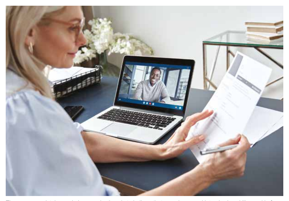
The common mistake made by organizations is to believe that experience and interviewing skills used in face-to-face interviews can directly be translated into a digital context.

On the matter of digitized video interviews, specific training in conducting video-interviews can moderate the signal distortion induced by the technological equipment, hence underlying the importance of training for professional skills. However, the common mistake made by organizations is to believe that experience and interviewing skills used in face-to-face interviews can directly be translated into a digital context, without adequate training for digitized interviews.