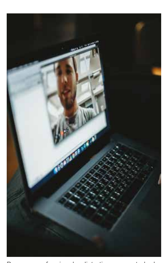
Because of signal distortions created by technology, recruiters are less able to use their expertise to judge whether the candidate is suitable for the position or not.

The abolishment of physical barrier sought through digitized video interviews is counterbalanced by the audio and video disruptions that influence interview pace and rhythm. Interviewers have to repeat or rephrase the question. The conversational approach normally used in a face-to-face interview leaves place to semi-structured questions. Because of signal distortions created by technology, recruiters