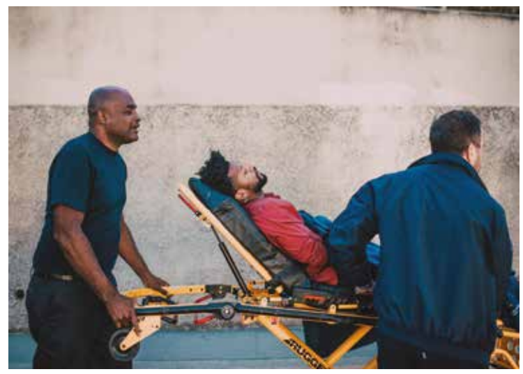
The sectors less likely to be subject to automation imply spending a higher proportion of working time on social and educational tasks.

lead to a plea for the mobilization of machines to replace human beings for repetitive and nonvalue-added tasks, enriching the tasks of the human person in what is unique and irreplaceable in terms of qualities and skills: flexibility, judgment, common sense, problem solving and creativity. Whether pessimistic or optimistic, predicting massive job destructions or creation of jobs; or concerned with the distributional aspect within the jobs affected, the fear of the replacement of the worker by the machine is brought back to the forefront with AI<sup>10</sup>.