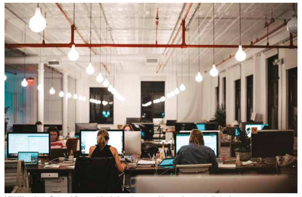
NWoW projects first and foremost imply brand new working environments that rely on open spaces, nonattributed workstations, new technologies, and a high degree of diversity in space planning.

As it has been said before, NWoW projects first and foremost imply brand new working environments that rely on open spaces, non-attributed workstations, new technologies, and a high degree of diversity in space planning. NWoW workspaces typically entail various types of work zones – areas of concentration, areas for collaboration, creative spaces, small "bubbles", various kinds of meeting rooms, or "touchdown offices". Research has shown that, despite the change process that leads to the implementation of NWoW workspaces, several types of deviant behaviours are commonly observed. HR practitioners and proximity managers should pay particular attention to how these behaviours impact the morale of their teams.