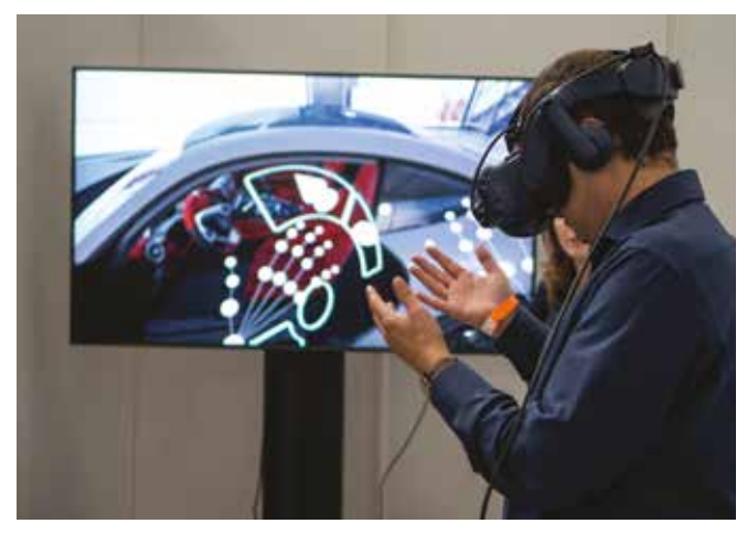
The use of virtual reality or mixed reality for applications related to vocational training and awareness raising.

With regard to training actions that companies can put in place, e-HRM systems provide flexible platforms for employees to follow training and development needs. In the last decade, digitalization has also encouraged the emergence of new trends in e-learning initiatives. Firstly, the use of virtual reality (100% virtual sessions) or mixed reality (a combination of virtual and physical sessions) for applications related to vocational training and awareness raising. These training sessions can also be embodied in serious gaming<sup>23</sup> principles. Secondly, the development of