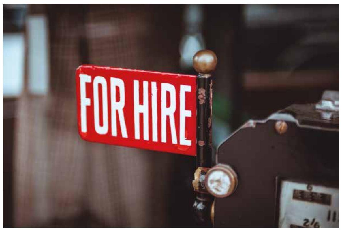
Robotic process automation (RPA), which is the automation of a business process via software is used to automate the recruitment process.

In recruitment, digital trends include digital professional and social network platforms (such as LinkedIn and Facebook) which started in the mid-to-late 2000s and are now mature. They provide additional and consolidated digital channels where firms can post their job opportunities and collect information on job candidates. Robotic process automation (RPA), which is the automation of a business process via software is used to automate the recruitment process. For example, RPA tools can allow an automated sorting of CVs. These tools are generally englobed in larger software applications called Applicant Tracking Systems (ATS), which organize and make searchable information about job seekers, job postings and job applications. Others aspects of the recruitment process can be mentioned such as the digital check of administrative documents (diplomas, training certifications, work certificate) with blockchain in order to counter forged documents.