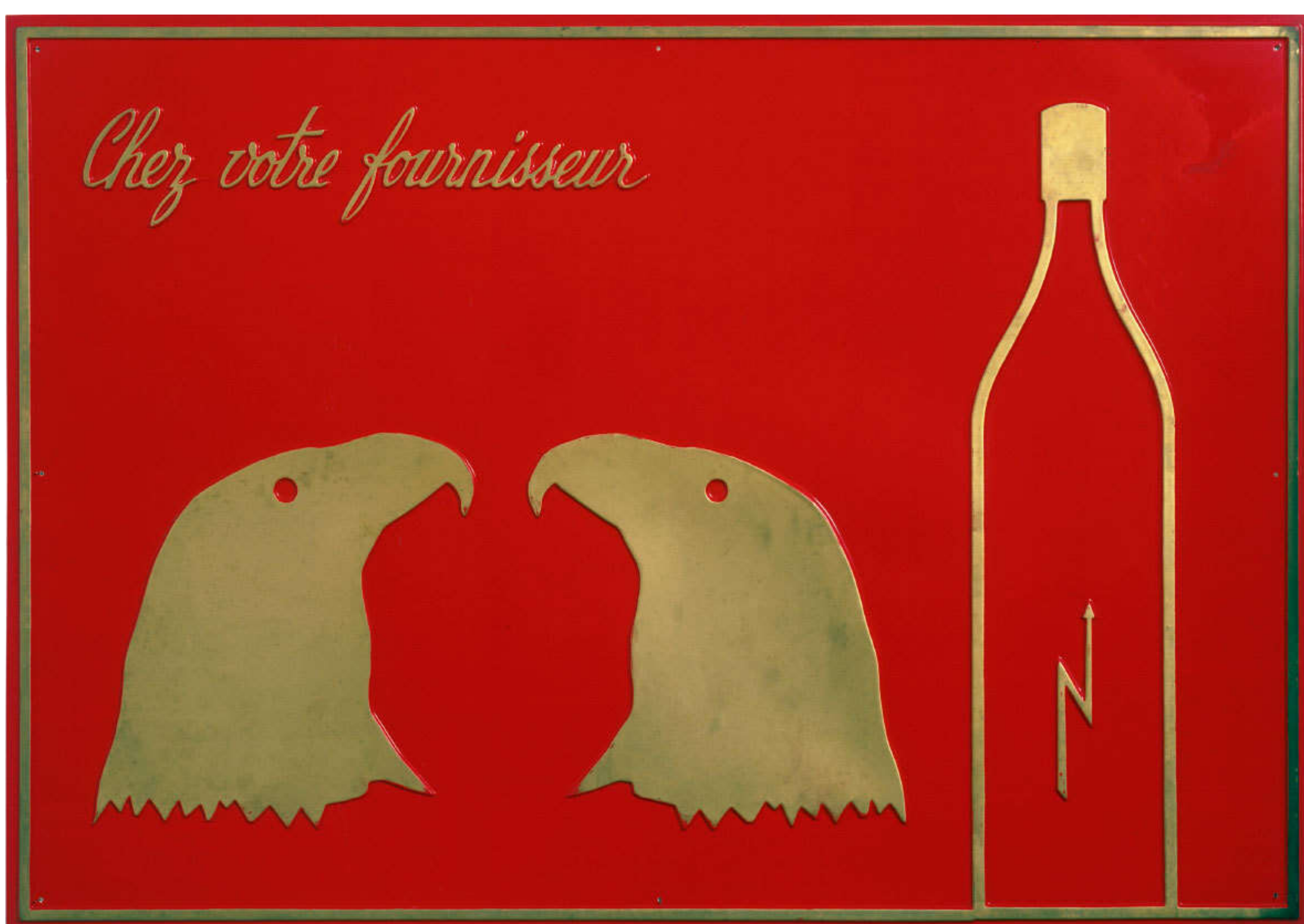
Marcel Broodthaers, Chez votre fournisseur (1968)

Key figure of the European counterculture of the 1960s and 1970s, Belgian poet and artist Marcel Broodthaers (1924-1976) places language (poetic, visual, pictorial, cinematic) at the core of his poignant and allegorical subversions creating a world of thermoformed texts, written objects and screen alphabets.