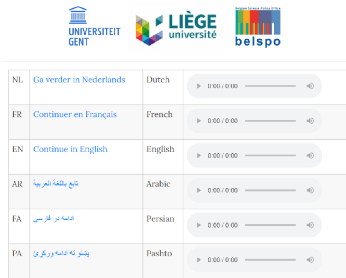
Figure 2. Welcome page on the website http://gsw2019.netlify.app

A letter with a link to a webpage was sent to the social service of the place of residence of the selected potential participant. This letter contained instructions for the social service and an individualized letter for the potential participant with an individualized code and link to the website. This code was unique to every potential participant (UG001, UL001 etc.).