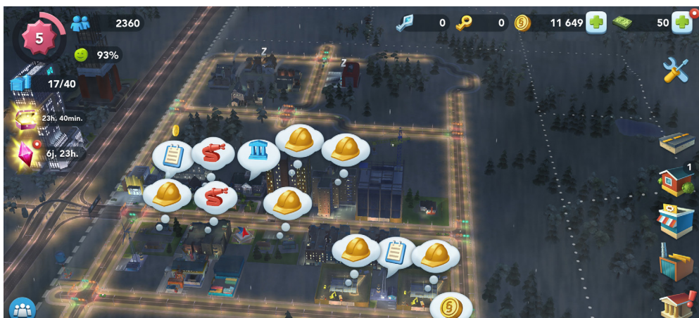
Picture 6: Two very similar ludemes for different transactions in BuildIt

While the reuse of the banknote is an example of citation from one work in another from the same franchise, and as such limits its effect to players familiar with the cited work, it integrates itself in a broader blurring of the line between real money and fictive transactions in BuildIt . What they have in common is their reliance on ludemic processes. The co-occurrence in the smartphone game of two very similar ludemes for different kinds of exchanges falls into the same category. Indeed, the Simoleon is composed of a coin grapheme, of a sound (acousteme) figuring the tinkle of falling coins, and points towards in-game earnings and expenses, while SimCash is represented by a banknote, accompanied by a slightly different metallic tinkle sound, and points towards real-world transactions (Picture 6).