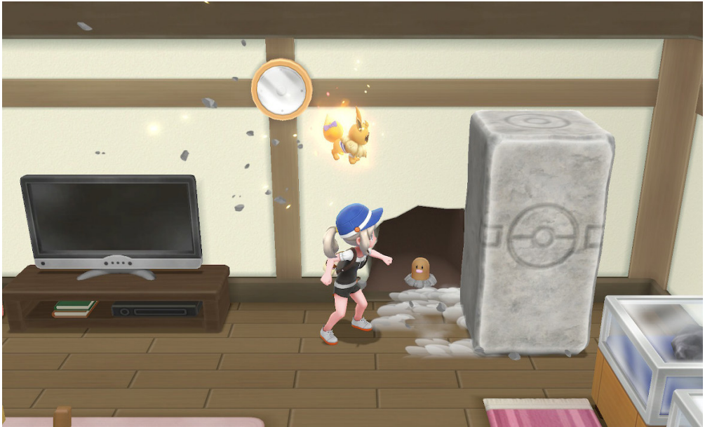
Picture 3: Pushing blocks with the Strong Push Technique in Pokémon: Let's Go Eevee