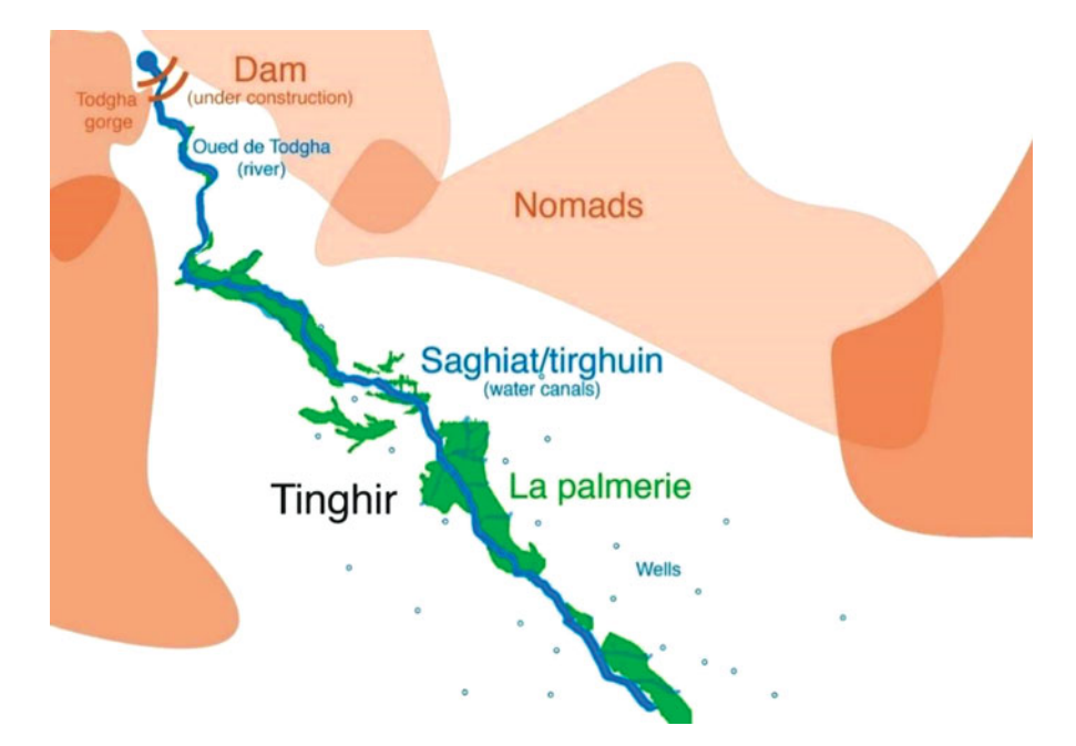
Fig. 4.1 Tinghir and the surrounding oasis

years, the valley has progressively become marginalized due to a strong rural exodus and brain drain towards big cities and foreign - mainly European - countries. Whilst, especially between the 1960s and 1970s, labour migration schemes were put in place to send the region's inhabitants to European countries such as Belgium and France, emigration is still ongoing. Male migrant workers were recruited from all social backgrounds, though more often from extremely poor families. Remittances from migrant workers living in Europe were mainly used to invest in Morocco's 'new' economy, in which remittances are invested in small businesses such as the construction trades, local transportation services, or civil service positions that resulted from increased investments in vocational training, secondary education, and business ownership. Moreover, this accelerated households' move away from the 'old' economy, which was based on land and livestock ownership (Kusunose and Rignall 2018). At the same time, the municipality of Tinghir itself attracts also a lot of immigrants from the wider surroundings (De Haas and El Ghanjou 2000), and nowadays even hosts many retired return migrants that decide to spend time in both their region of origin and Europe as a compromise between their two 'home' countries (De Haas 2006; Kusunose and Rignall 2018).