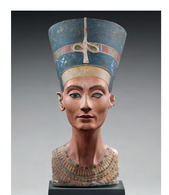
Fig. 1: the so-called Berlin bust of Nefertiti (ÄM 21300; H. 49; W. 24.5; D. 35 cm), discovered in the annex of the reception hall of the house of the sculptor Thutmose at Amarna (P.47.2/19), on December 6 1912, by the Deutsche Orient Gesellschaft.

of analysis, R. Krauss also pointed out that the upper part of the faces of Akhenaten and Nefertiti, from the base of the nose to the start of the hairline on the forehead (which corresponds to a unit in the system of construction of human figures in Egyptian art), is identical both in size and in morphology. Recent investigations using 3D digital tools confirm that