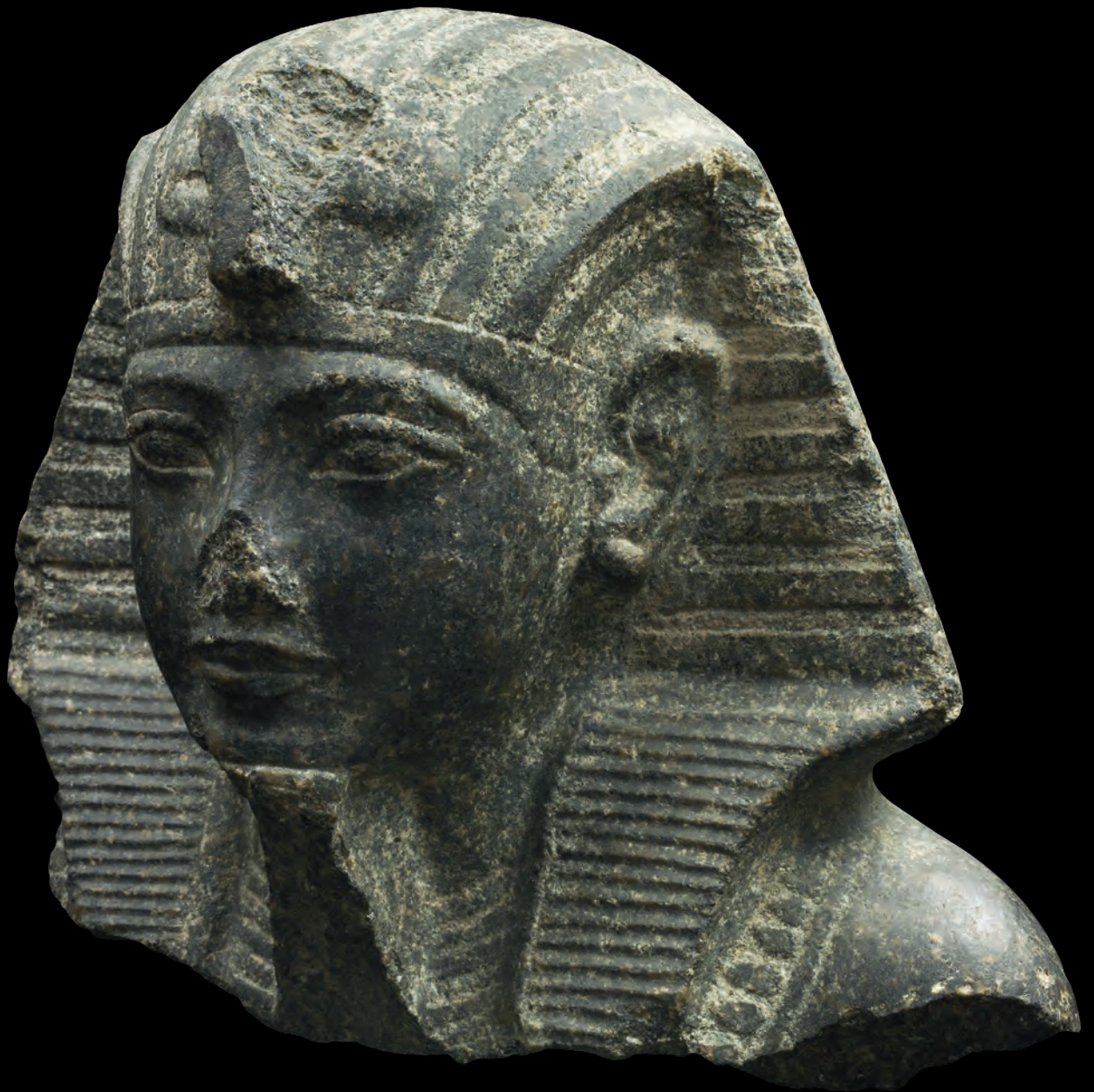
Head of a statue of Tutankhamun. Granodiorite. (Brussels, Royal Museums of Art and History, E.7279; H. 27.5; W. 20 cm).