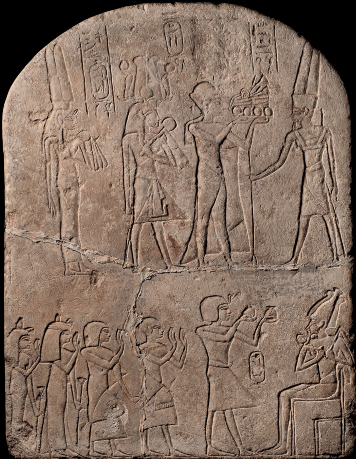
Limestone stela depicting a post-Amarna ruler whose name has been erased — probably Tutankhamun or Ay — in the act of presenting offerings to the god Amun-Re of Thebes, followed by his ancestor Pharaoh Ahmose, founder of the Eighteenth Dynasty, and his queen, Ahmose Nefertari. In the lower register is their son, King Amenhotep I, offering to Osiris and followed by anonymous individuals. (Manchester Museum inv. 2938; H. 43; W. 33.5 cm).