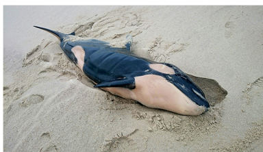
Fig. 1. Picture of the neonate male killer whale stranded on 8 February 2016 on the beach of Rantum, on the German island of Sylt.

pollutants, such as PCBs (28 congeners), polybrominated diphenyl ethers (PBDEs) and Dichlorodiphenyltrichloroethane and metabolites (DDTs). The method used for sample extraction and clean-up has been previously described by Das et al., 2017. Liver samples were analysed for mercury following the method described by Cransveld et al., 2017. Skin samples were collected caudal to the dorsal fin for genotyping of the mitochondrial control region using established standard odontocete primers ProL and DLH (Tiedemann et al., 1996; Wiemann et al., 2010). For the analysed part of the mtDNA, many sequences from killer whales around the world are available in genetic databases. Hence, such genetic analyses can provide insight into the putative origin of the individuals, enabling them to be assigned to a certain population/ecotype (Foote et al., 2009; Morin et al., 2010).