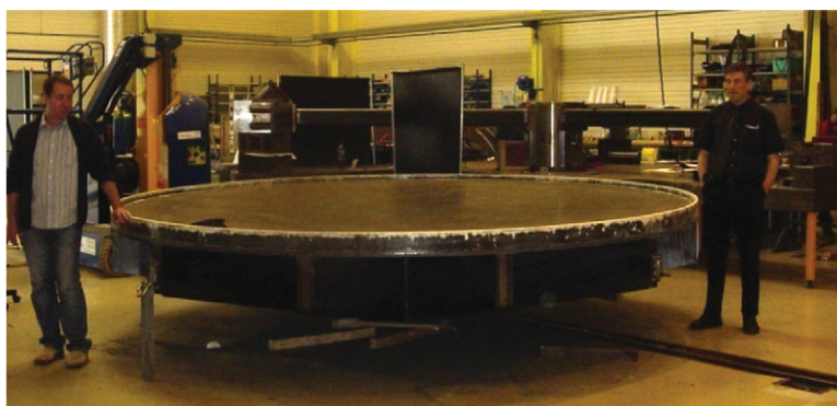
Figure 2. The mirror container is a key component of the system. It must fulfil strict specifications of rigidity and temperature stability in order to guarantee a final shape that is as perfect as possible and to avoid the formation of wavelets on the surface of the mercury.

the image of a point-like source will be degraded and cannot be fitted with a gaussian “seeing” profile. Furthermore, the integration time across the FOV is not the same, and will depend on the declination of the object. In practical terms that effect will depend on the terrestrial latitude where the ILMT is installed. To correct such effects, we designed and built a dedicated corrector that enabled us to eliminate the (well known) Time Delay Integration (TDI) effect. Since the correction is latitude dependent, a dedicated corrector is needed to compensate for the latitude correction of each installation site.