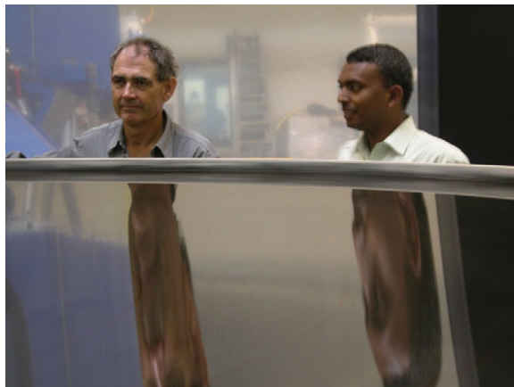
Figure 1. The high quality of the mirror surface.