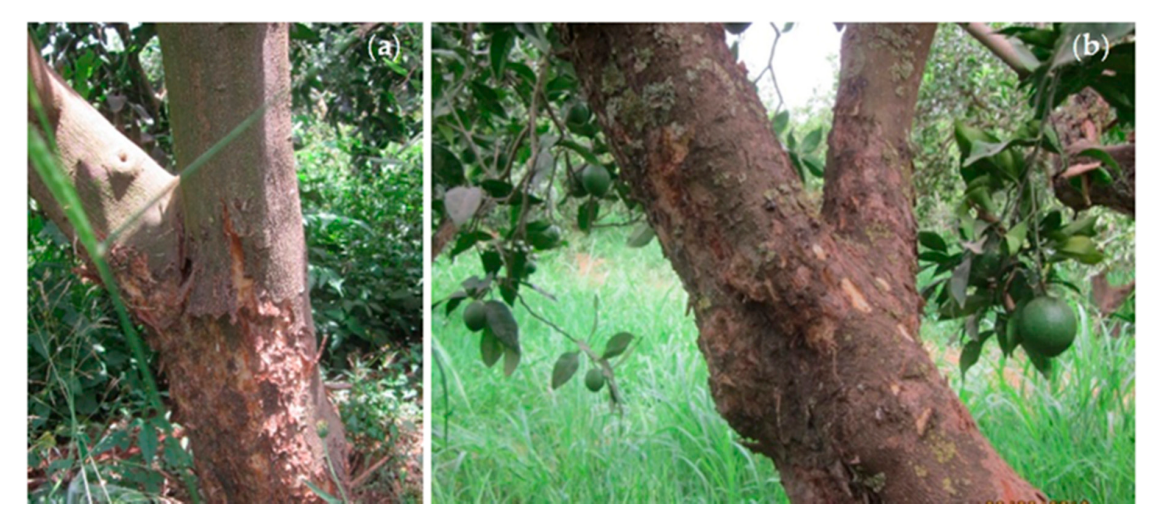
Figure 2. Field symptoms of citrus psorosis disease observed in Moroccan citrus orchards in the Moulouya region in 2019. ( a ) Bark scaling and gumming restricted to the stem and main branches of sweet orange trees, characteristic of psorosis A (PsA); ( b ) rampant bark scaling affecting thin branches of sweet orange trees, characteristic of PsB.