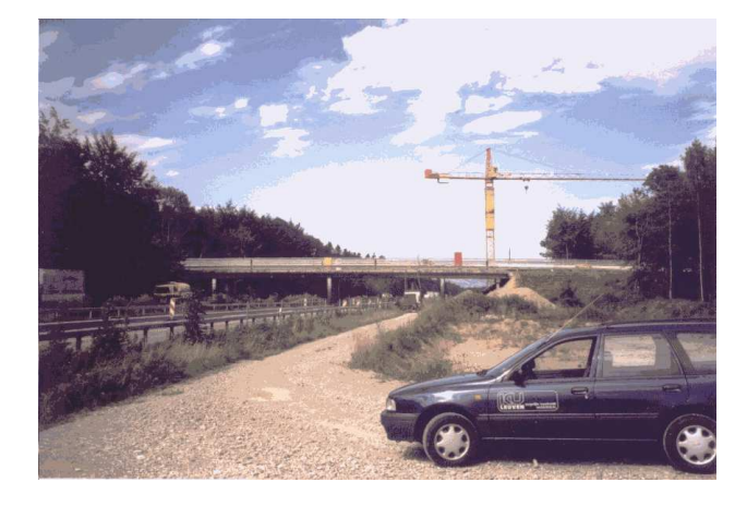
Figure 5: View of Z24 bridge.

ios were applied to a prestressed concrete bridge in Switzerland to detect, localise and quantify artificially applied damage. The test set-up and damage scenarios are described here. The analysis procedure and experimental validation results of direct stiffness calculation technique were reported and discussed in [10].