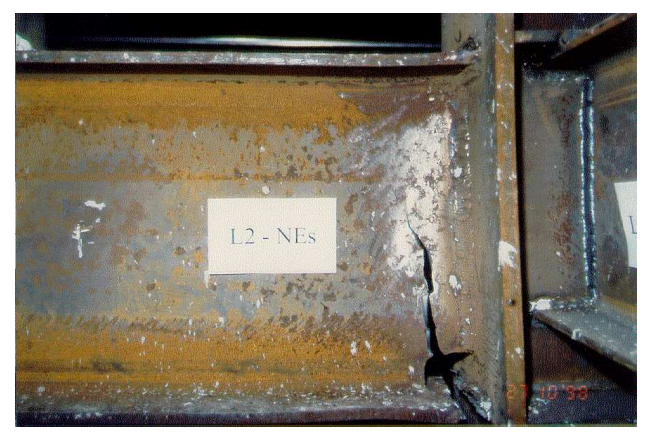
Figure 4: Example of a crack at a beam-to-column joint.

puted using the finite element program SAMCEF [8]. Basically, the sensors were placed at the corners of the storeys to catch the deformation of the columns and four of them were located in the middle of the beams to catch the bending and torsion modes of the slabs. Impact excitation was produced at four locations. For each test, eight to ten hammer impacts were produced and the time responses of each sensor were recorded. Frequency response functions (FRF) were