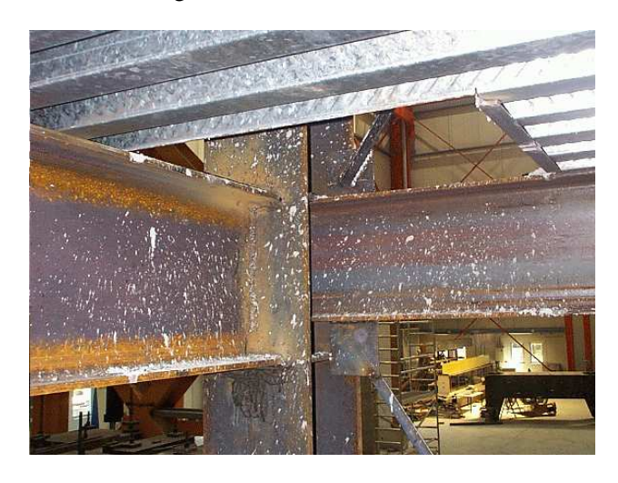
Figure 3: Detail of a joint - first storey (internal view).

puted using the finite element program SAMCEF [8]. Basically, the sensors were placed at the corners of the storeys to catch the deformation of the columns and four of them were located in the middle of the beams to catch the bending and torsion modes of the slabs. Impact excitation was produced at four locations. For each test, eight to ten hammer impacts were produced and the time responses of each sensor were recorded. Frequency response functions (FRF) were