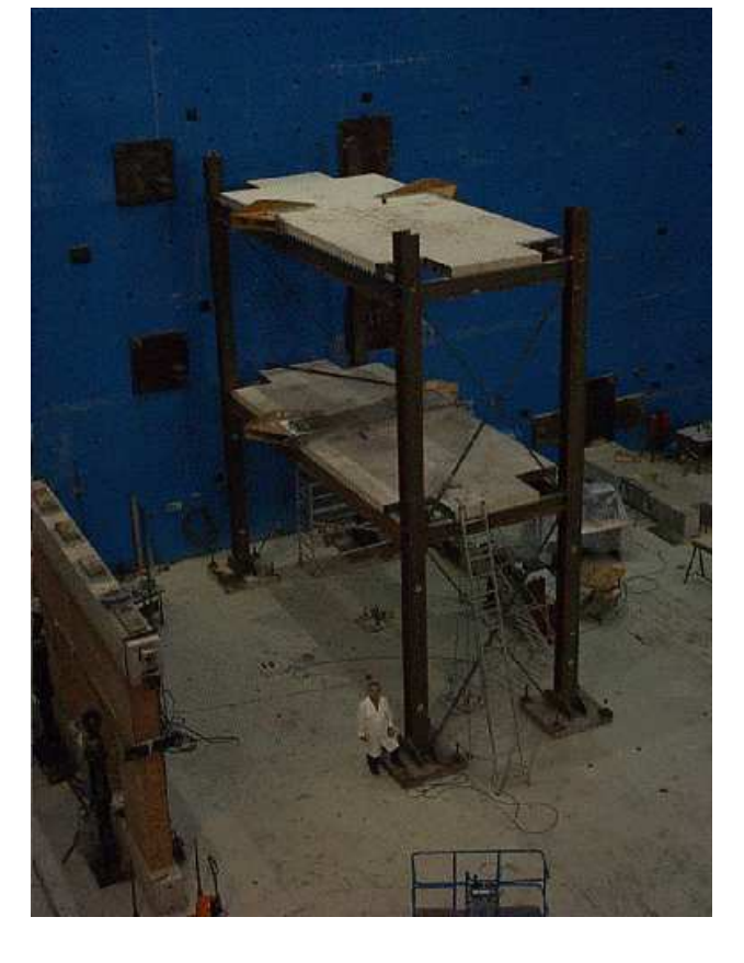
Figure 1: The STEELQUAKE structure.

The main dimensions of the structure are 8m by 9m by 3m. The storeys are made up of corrugated steel