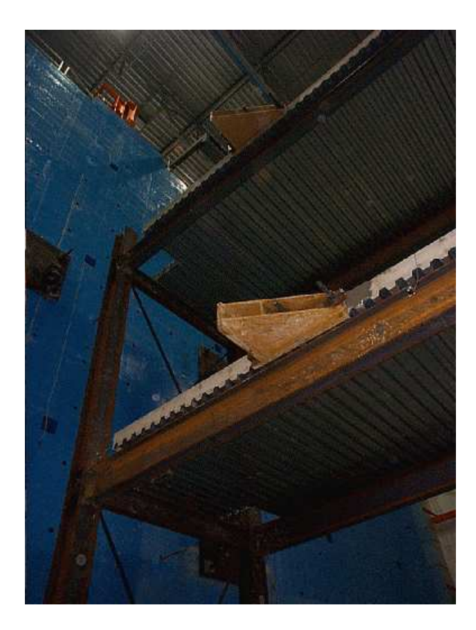
Figure 2: Detail of the stories.