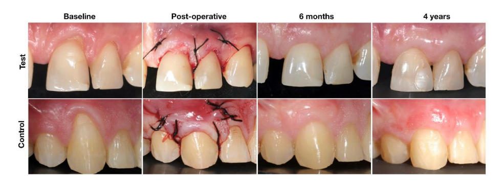
Figure 2. Surgical procedures and follow-up in Test (POT + CTG) and Control (CAF + CTG).

Baseline, surgical procedures and sutures placement, six-months follow-up and four years follow-up.