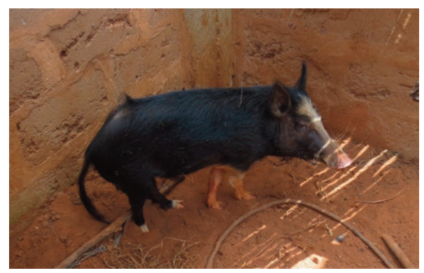
Fig. 2. Local boar

Local pig has sexual precocity that is not valued in traditional breeding (Agbokounou et al. , 2016). Under traditional breeding conditions, the age at puberty of West Africa local pig ranges from 221 days to 245 days and sometimes 302 days in free range (d'Orgeval Dubouchet, 1997; Nonfon, 2005; Nwakpu and Ugwu, 2009; Nwakpu and Onu, 2011; Agbokounou et al. , 2016). This age is similar to the reported age of