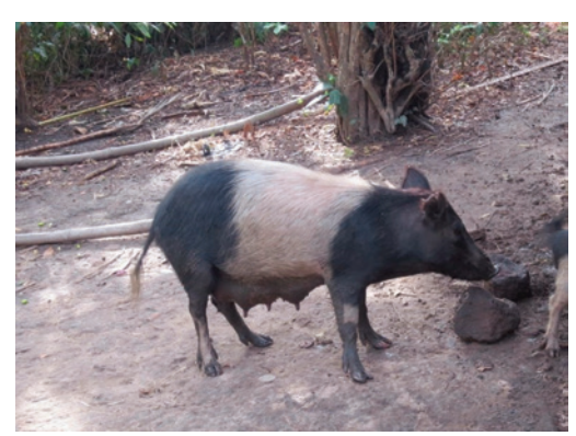
Fig. 1. Local sow