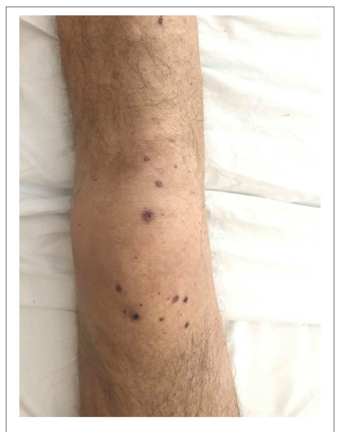
FIGURE 1 | Dark red, necrotic, slightly tender lesions developed symmetrically on MCP joints and knees.

With this case we report a unique and rare but severe side effect of pembrolizumab with long-lasting consequences in a NSCLC