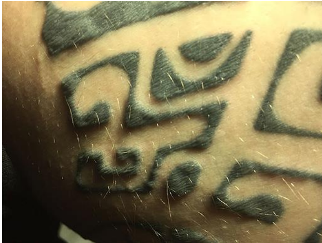
Fig. 1. A grazing light incidence clearly reveals the granulomatous aspect of the tattoos of the patient.